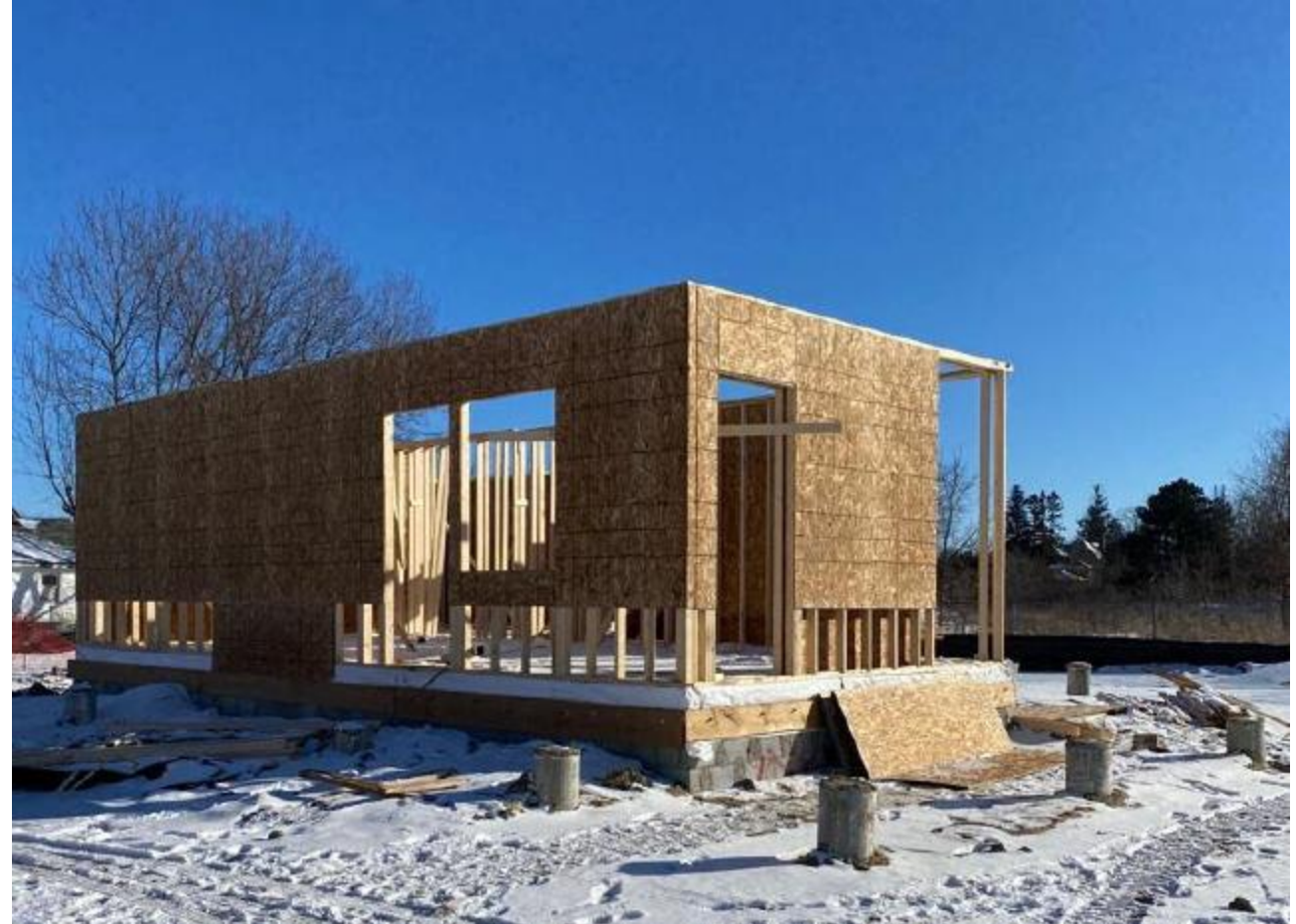
Structural framing of walls (Building 4)