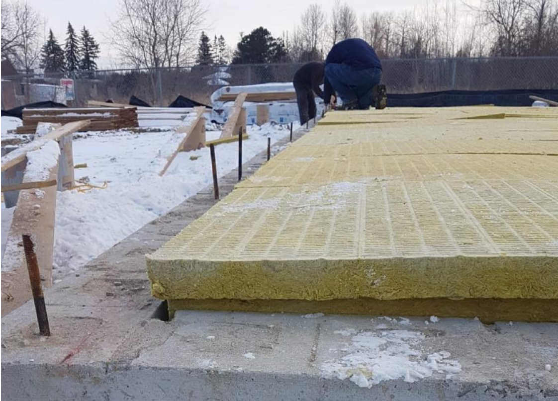
Installation of flooring insulation