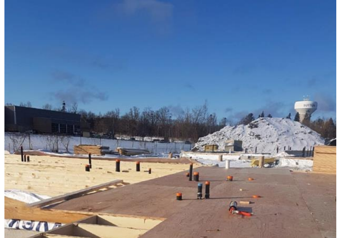
Structural framing of floors