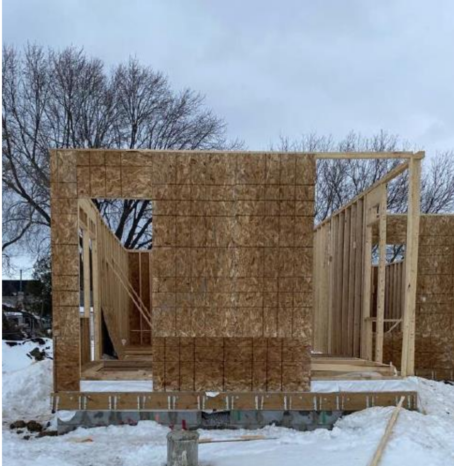
Structural framing of walls (Building 4)