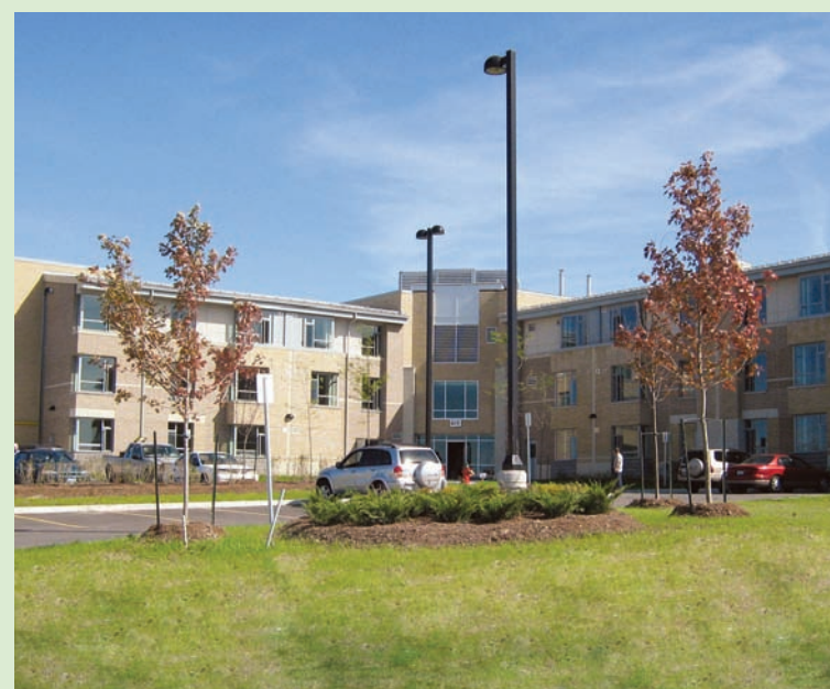
Tom Taylor Place

York Region will continue to lead by example and adopt rigorous standards for energy conservation in future building projects. Being leaders in conservation and energy management is important in creating a sustainable community.