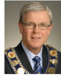
Mayor Geoffrey Dawe Aurora