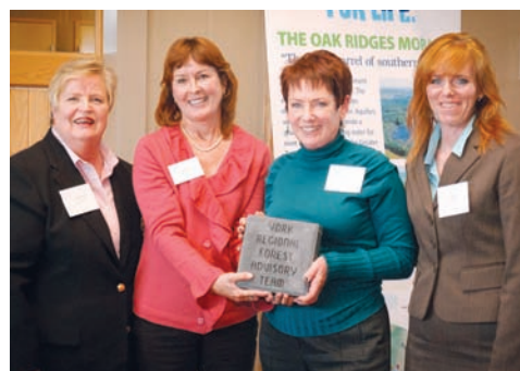
Moraine Hero Award for the York Regional Forest Advisory Team

York Region is one of Canada's fastest growing municipalities, adding an average of 30,000 new residents each year. Accommodating this growth is a challenge the Region carefully and strategically manages.