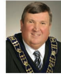
Mayor Wayne Emmerson Whitchurch-Stouffville