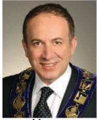
Mayor Maurizio Bevilacqua Vaughan