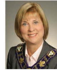
Mayor Virginia Hackson East Gwillimbury