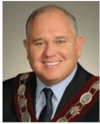
Mayor Frank Scarpitti Markham