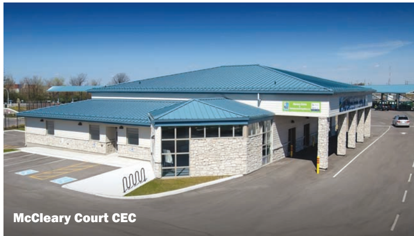
McCleary Court CEC

The McCleary Court CEC is the first of three facilities that York Region has planned over the coming years. Construction of York Region's new CEC in Richmond Hill continues (located on Elgin Mills Road between Bayview Avenue and Leslie Street) and will be complete this spring.