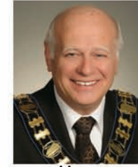
Mayor Tony Van Bynen Newmarket

The Regional Municipality of York 905-830-4444 or 1-877-464-9675