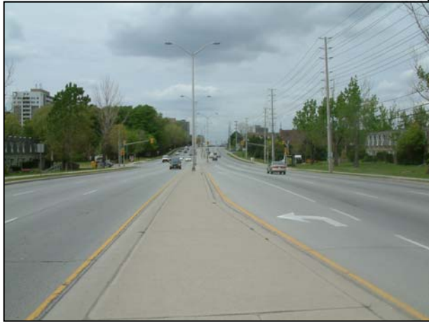
Near Bloor Street