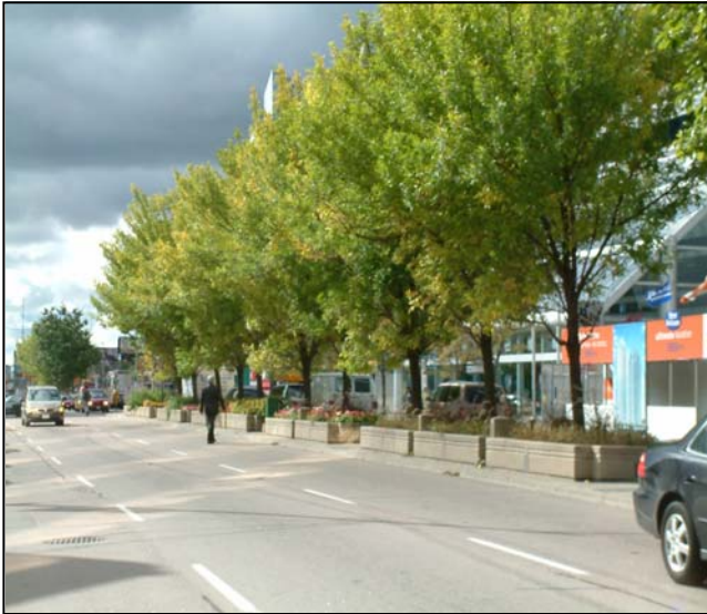
Yonge Street, near Sheppard Avenue (City of Toronto)