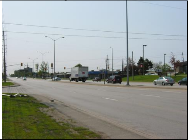
Near Eglinton Avenue