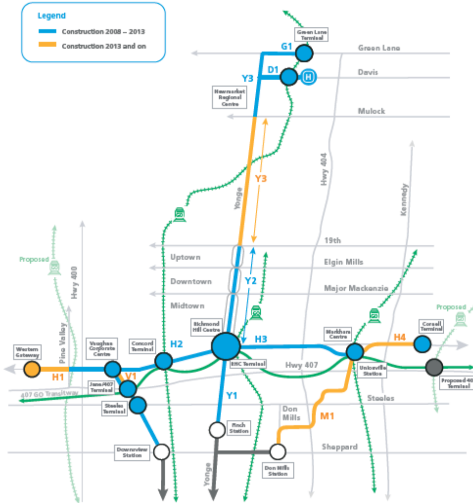
Figure 1 York Region Rapid Transit Network – Phase 2