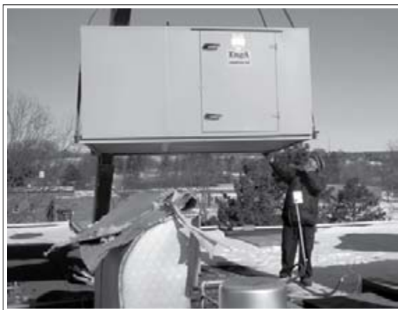
A new make-up air system being placed on the roof by crane at Pineview Terrace in Keswick.

Housing York Inc. received special funding from the provincial and federal governments to make improvements to its communities across York Region.