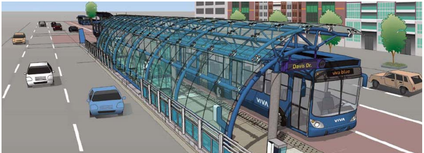
Conceptual rendering of the Viva Yonge Rapidway at Davis Drive