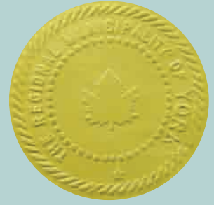
First official regional seal

On June 26, 1970, the provincial legislature passed Bill 102 An Act to Establish the Regional Municipality of York, coming into force on January 1, 1971.