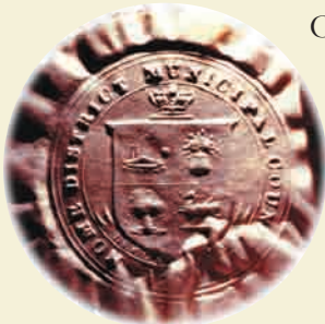
Home district seal

By 1842, the population of the County (including the current York Region, Toronto and other municipalities) was 45,811. It had doubled by 1861 to 104,495; and grew to 566,885 by 1921.