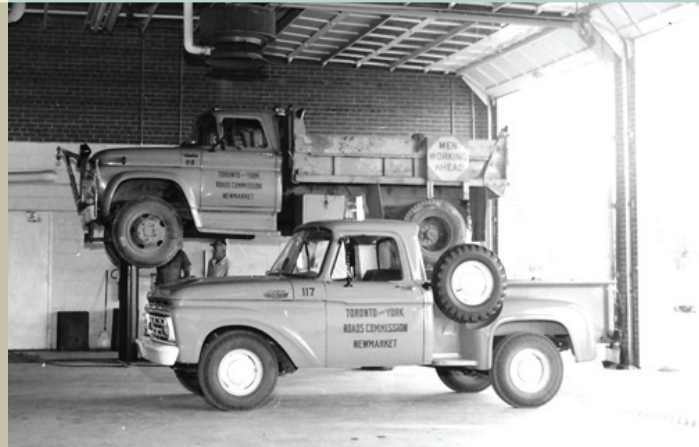
Toronto and York Roads Commission Garage

On February 10, 1916, York County passed by-law 1185 “To Adopt a System of Suburban Roads Throughout the County.” In 1918, by Order-in-Council, the name was changed from Board of Highway Commissioners of York to The Toronto and York Roads Commission. Over time this Board took on the roles of both constructing and maintaining the County Roads System. The Toronto and York Roads Commission was dissolved in 1971 with the passing of the Regional Municipality of York Act.