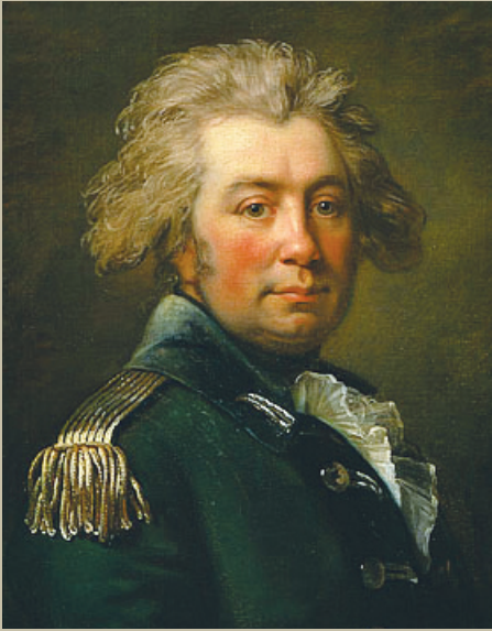
John Graves Simcoe, first Lieutenant-Governor of Upper Canada

In 1791 Upper Canada was created by the Constitutional or Canada Act passed by the British Parliament. On July 16, 1792, John Graves Simcoe, the first Lieutenant-Governor of Upper Canada, issued a proclamation dividing Upper Canada into 19 counties including York County.