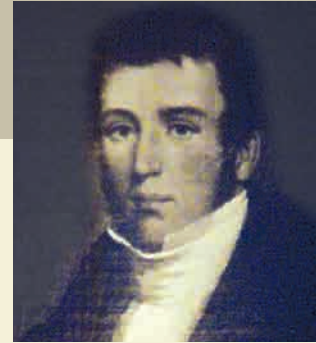
Franklin Jackes, first Warden of York County

From 1791 to 1841, local affairs in the Home District were administered by a District Court of Quarter Sessions of the Peace, comprised of justices of the peace. These courts met quarterly to try legal cases and to oversee the administration of the area.