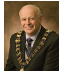
Mayor Tony Van Bynen Town of Newmarket