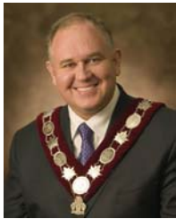
Mayor Frank Scarpitti Town of Markham