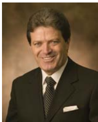
Regional Councillor Gino Rosati City of Vaughan