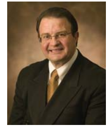
Regional Councillor Vito Spatafora Town of Richmond Hill