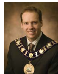
Mayor James Young Town of East Gwillimbury