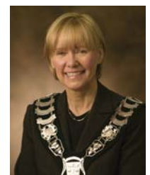
Mayor Margaret Black Township of King