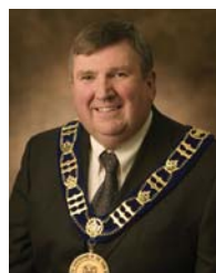
Mayor Wayne Emmerson Town of Whitchurch-Stouffville