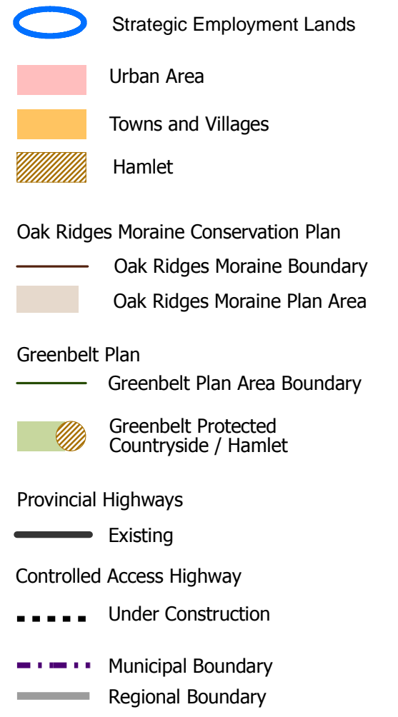
Figure 2 YORK REGION STRATEGIC EMPLOYMENT LANDS