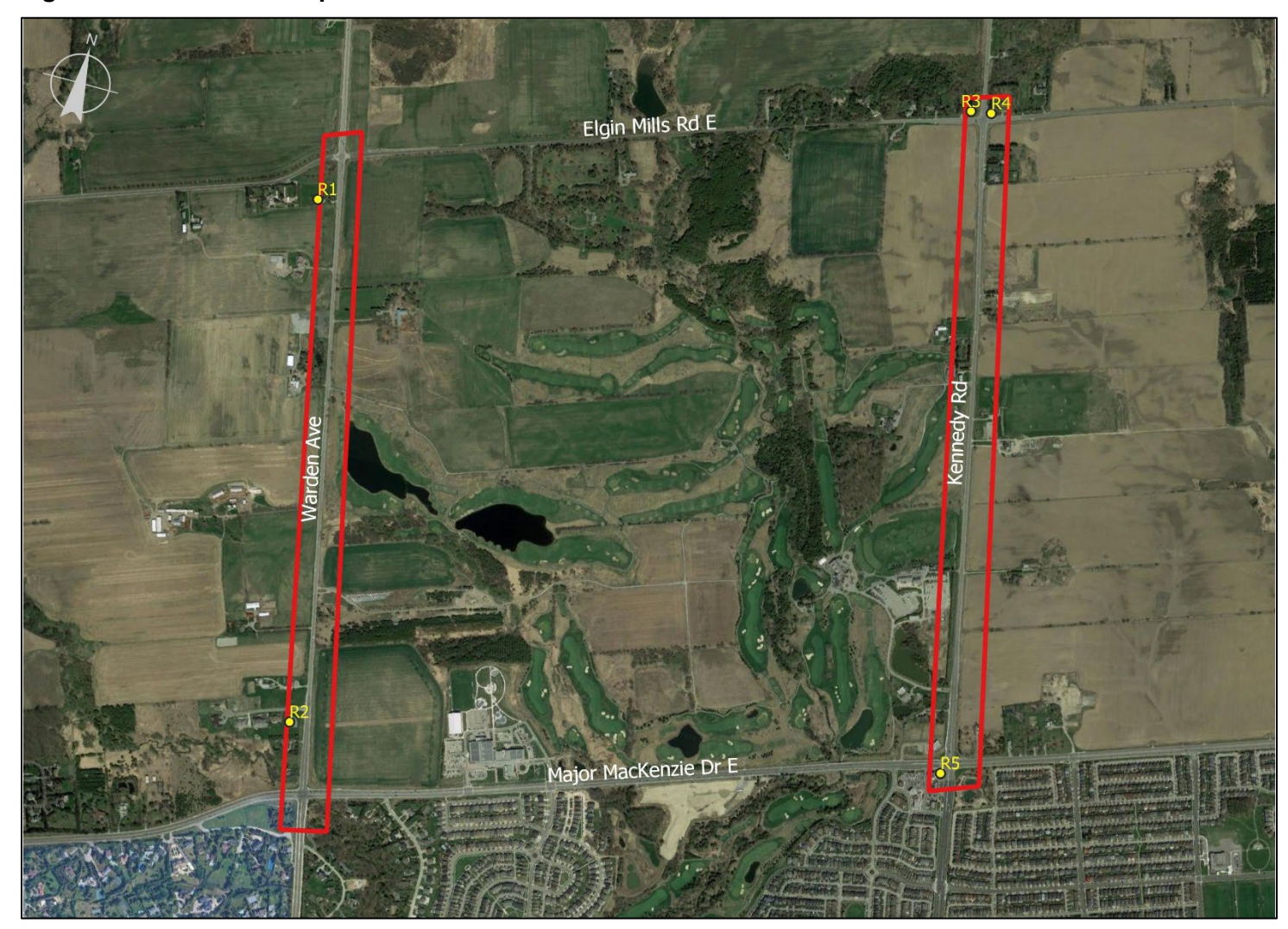
Figure 2: Sensitive Receptors

Air Quality Impact Assessment Report November 2022