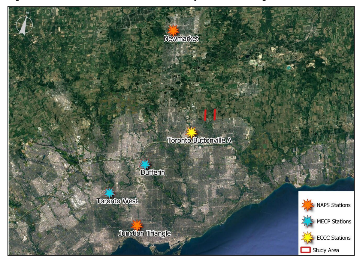
Figure 4: MECP, NAPS, and ECCC Air Quality and Meteorological Stations