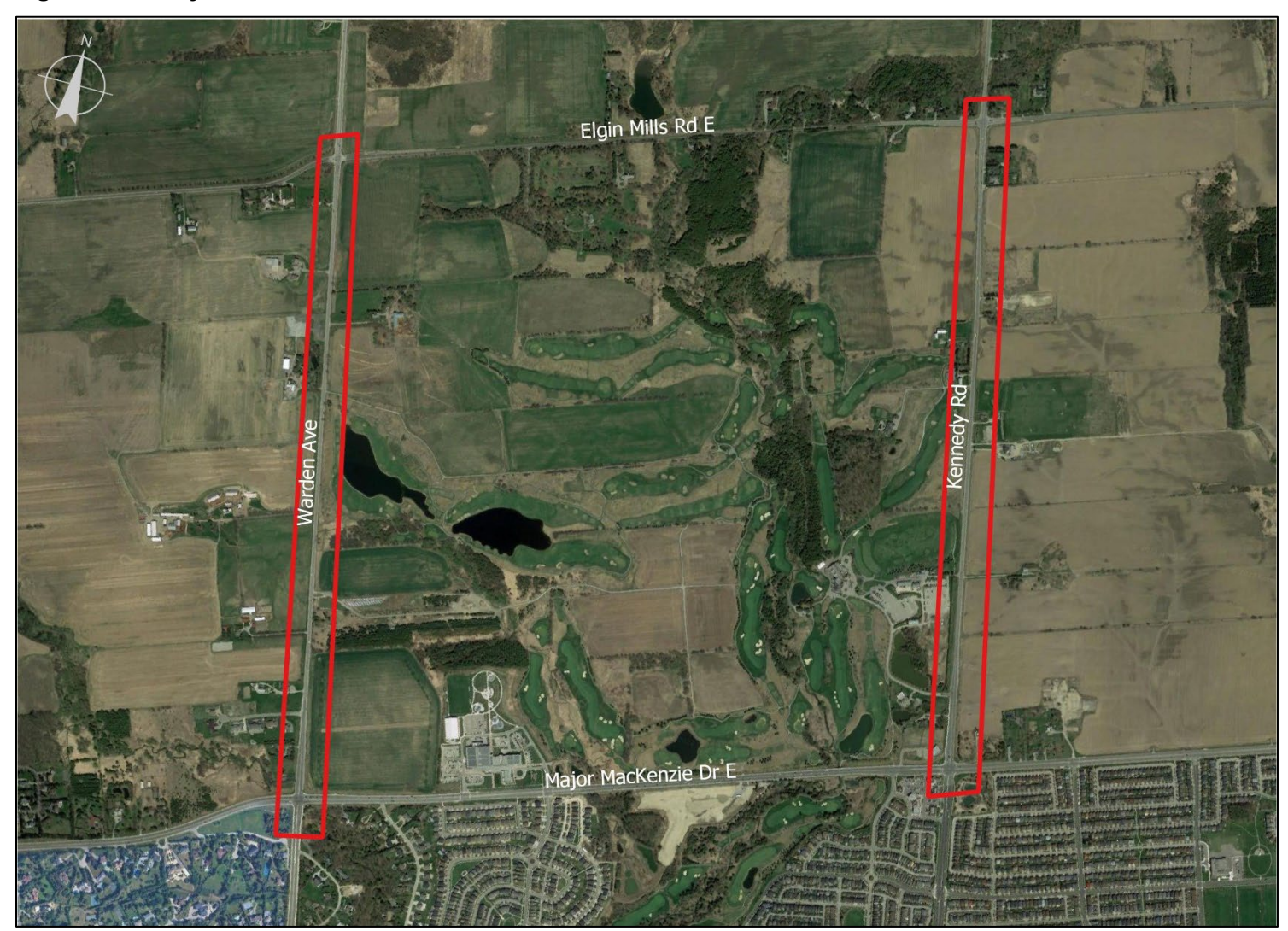
Figure 1: Study Area

Air Quality Impact Assessment Report November 2022