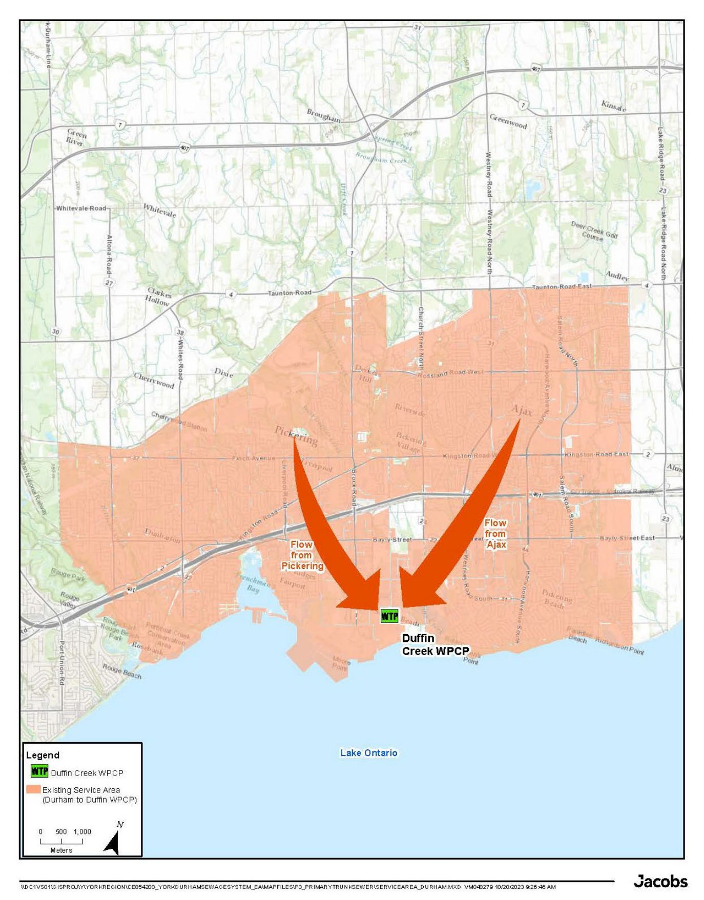
Figure 1.2 Duffin Creek WPCP Servicing Map for Durham Region