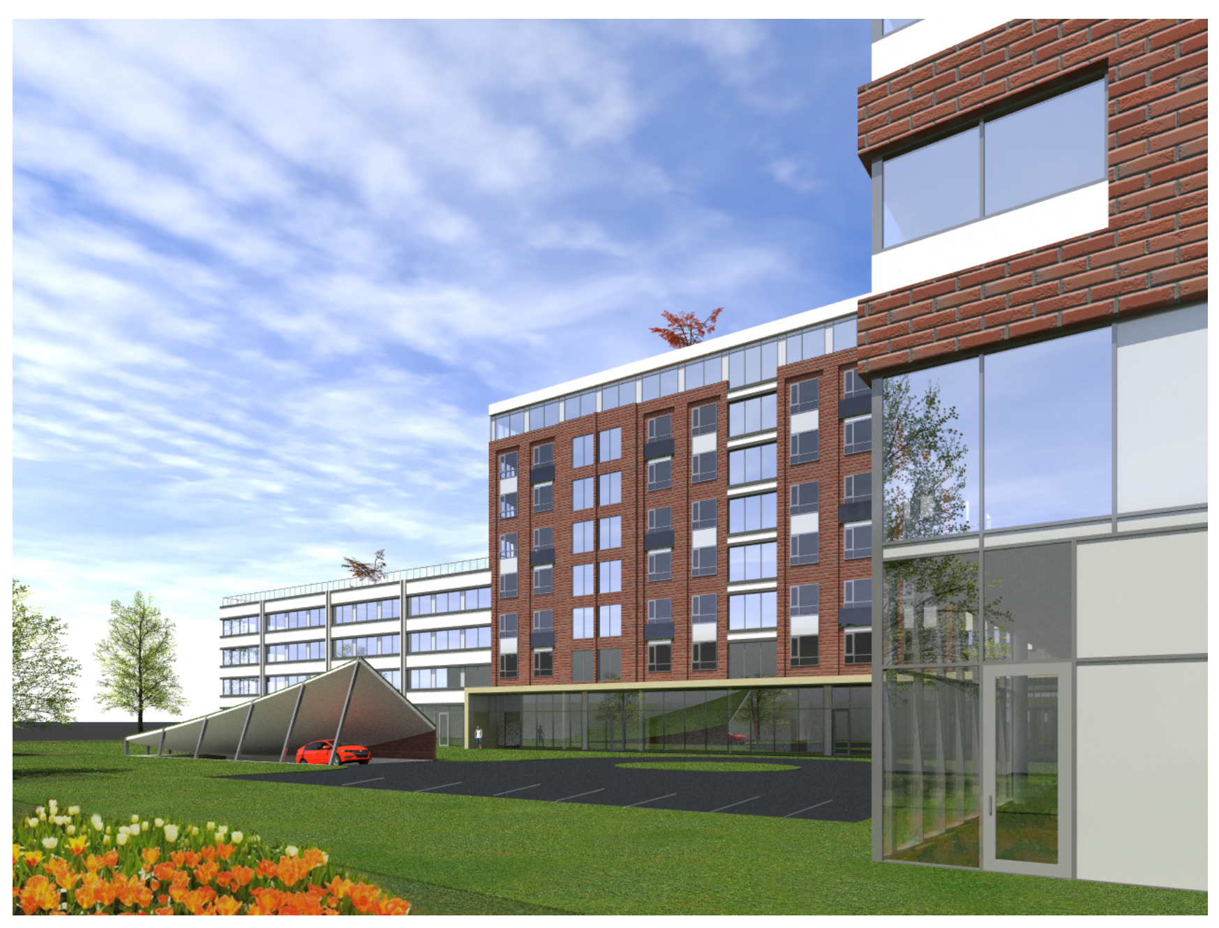
View looking North West