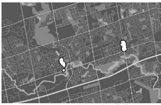
Figure 1 Variation in Municipal Waste Collection of Commercial Properties