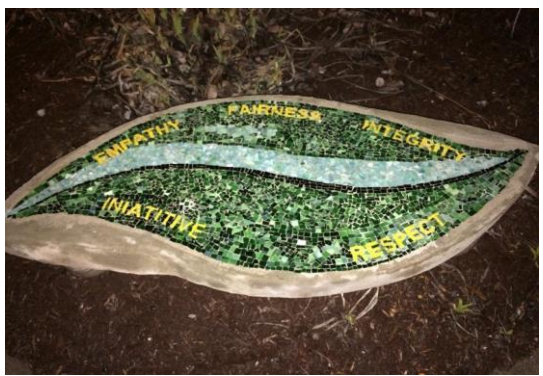
Attribute garden at Mount Albert Public School