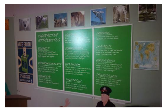
Community Safety Village – Whitchurch- Stouffville