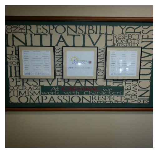
Cardinal GC hallway