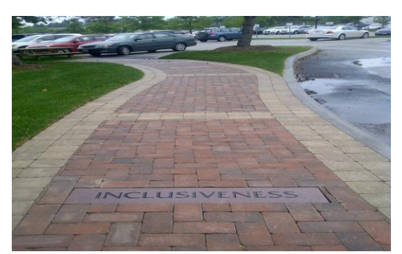
Town of East Gwillimbury walkway