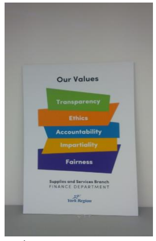
York Region Meeting Room