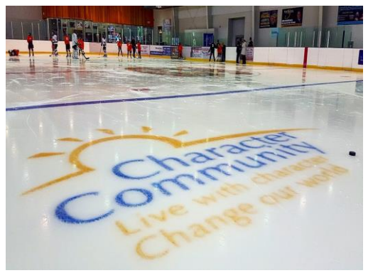
Ice surface Town of Aurora