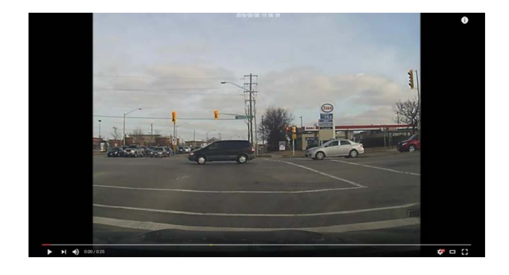
Case 2