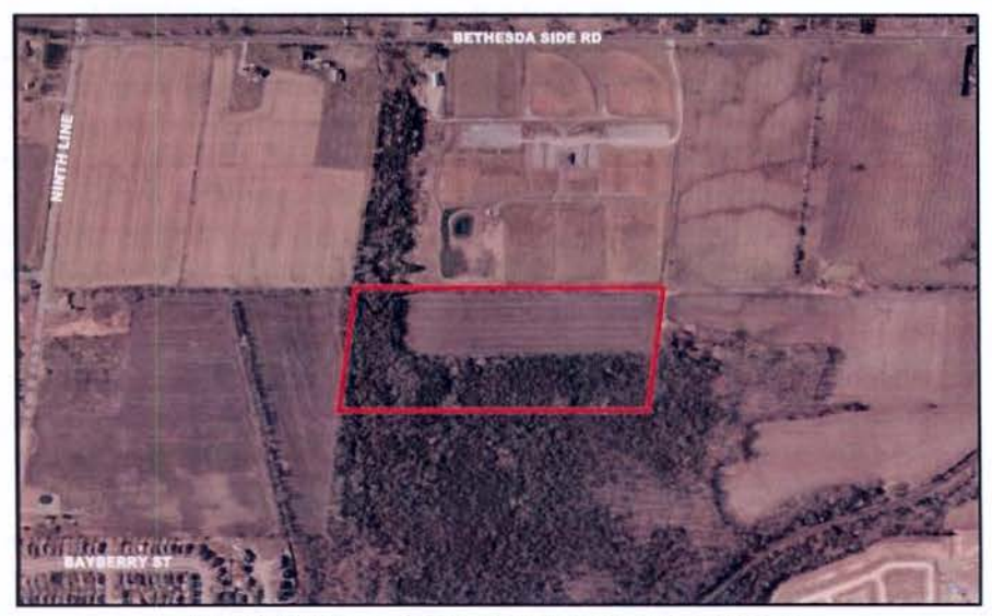
Figure 1: Approximate location of subject lands.

Weston Consulting was recently retained by the owner of the property legally described as PT LT 4, CON 9, WHITCHURCH, PT 1, 65R31567, WHITCHURCH-STOUFFVILLE; T/W EASE OVER PT LT 4, CON 9, PT 2, 65R31567, AS IN A67176A; T/W EASE OVER PT LT 5, CON 9, PT 3, 65R31567, AS IN YR1026395. The subject property is approximately 10.3 ha (25.4 acres) in area and located between Ninth and Tenth Line, south of Bethesda Road, and directly north of the Stouffville Conservation Area (Figure 1). This property is contained in the Phase 3 lands and designated on Schedule F (as amended by OPA 137) as "Greenland Areas" and "Residential Area" (Figure 2). It falls within the Access Study Area delineated on Schedule F by a brown line. There is a proposed road traversing this property that is identified in Schedule F as "Potential Access Study Area Roads." Schedule F also identifies that the western limit of the property is within a "Flood Plain Area" associated with the Duffins Creek tributary.