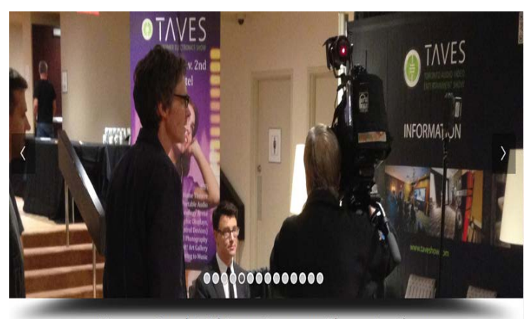
Discover Canada's Ultimate Consumer Electronics Show

The Broadband and Innovation Summit will be delivered in partnership with the TAVES Consumer Electronics Show