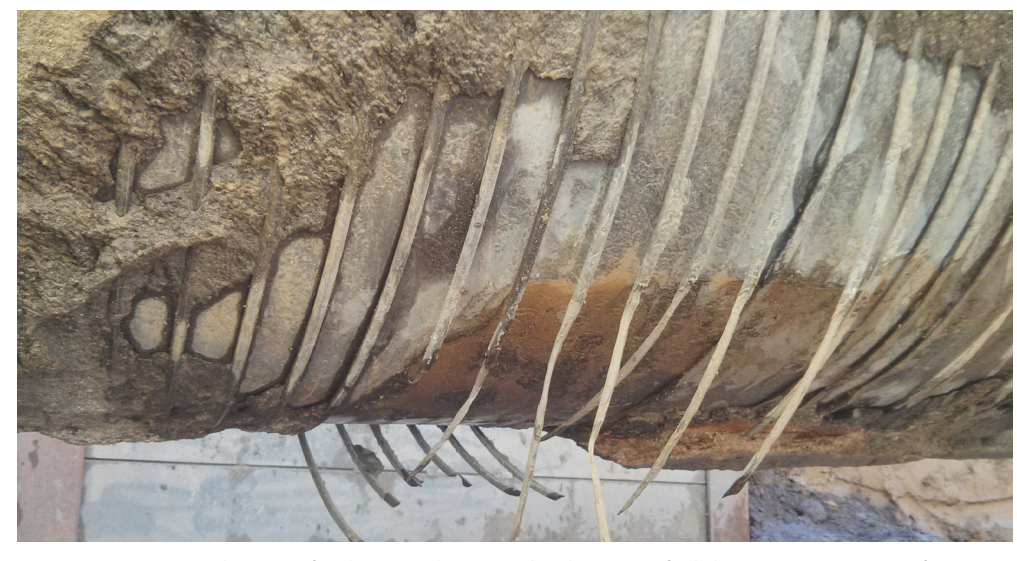
In August 2013, The City of Calgary and Pure Technologies verified distress on a section of BWP on the Memorial Feedermain, finding broken bars and a large area of cylinder corrosion.

The type of failure is also much different; PCCP tends to fail suddenly with a large dispersion of energy. This type of failure is less likely in BWP