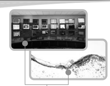
Senemac and Water Centre Hubs