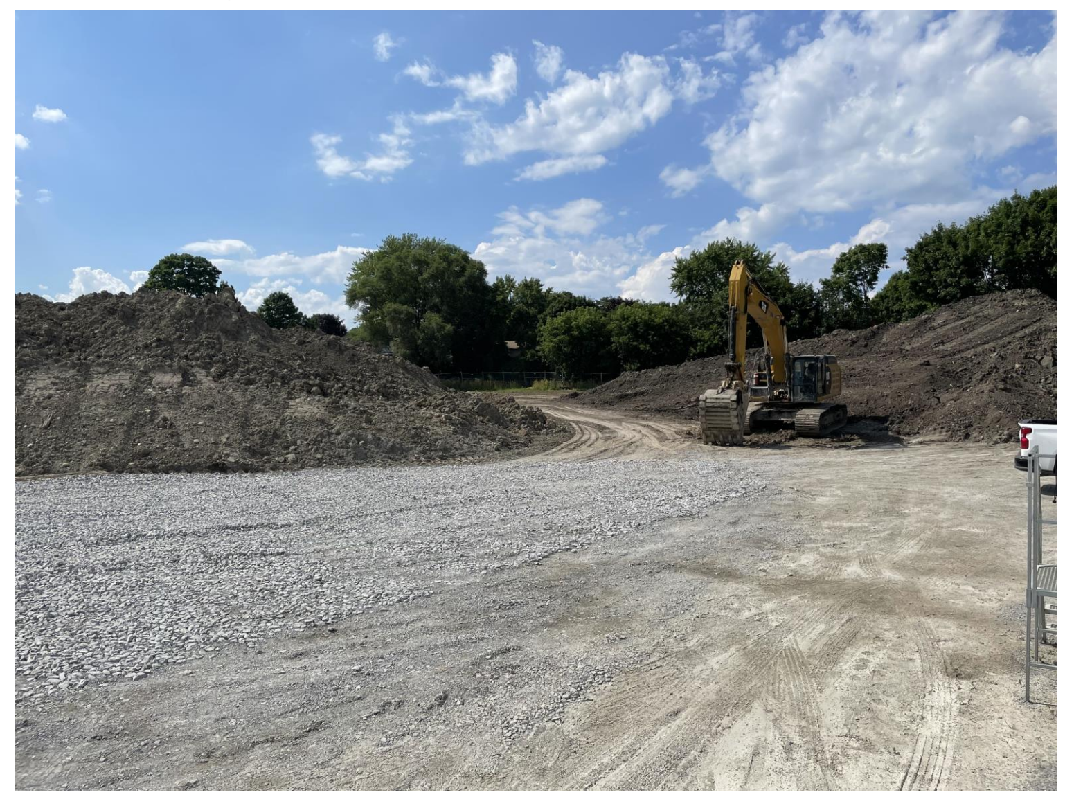
August 9, 2022