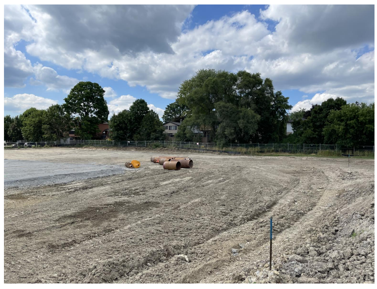
August 9, 2022