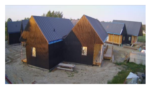
The Bridge 20898 Dalton Road, Georgina

People experiencing homelessness in York Region who are seeking shelter are asked to contact the York Region Emergency Housing Central Intake Line at 1-877-464-9675 ext. 76140. This phone line is answered 24 hours a day, seven days a week.