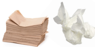
Paper towels, napkins and tissues