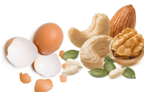
Nuts and shells