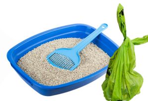
Pet waste (including cat litter)

Search what goes where at york.ca/Bindicator