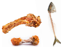
Meat and bones, fish and seafood