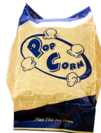
Microwave popcorn bags