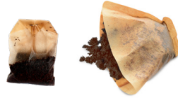
Coffee grounds, filters and tea bags