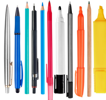
Markers and pens