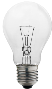
Incandescent light bulbs