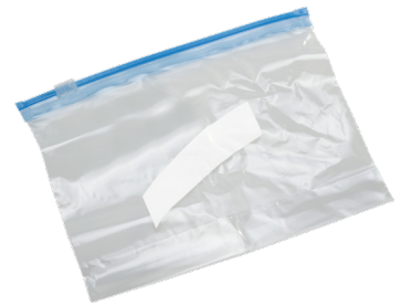
Resealable freezer and snack bags