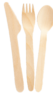
Disposable, compostable cutlery