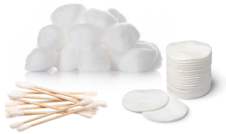
Cotton balls, swabs and pads