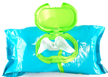
Wipes, mops and dryer sheets