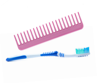
Combs and toothbrushes