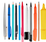
Markers and pens