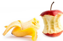
Fruits and vegetables