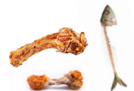
Meat and bones, fish and seafood