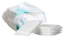
Disposable diapers, sanitary and incontinence products