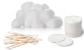
Cotton balls, swabs and pads