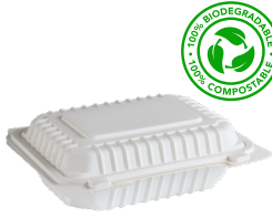
Biodegradable and compostable plastics

For buildings with no green bin or compost collection.