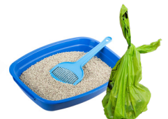
Pet waste (including cat litter)