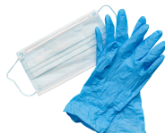
Single-use masks and gloves