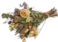
Houseplants and flowers (no pots or soil)