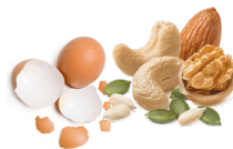
Nuts and shells