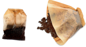
Coffee grounds, filters and tea bags