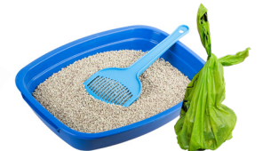
Pet waste (including cat litter)