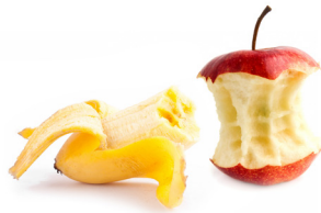
Fruits and vegetables