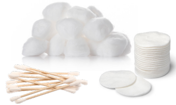
Cotton balls, swabs and pads