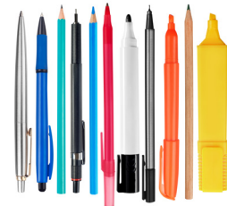
Markers and pens