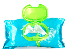
Wipes, mops and dryer sheets