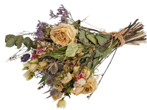
Houseplants and flowers (no pots or soil)