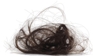
Fur and hair