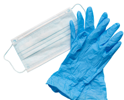
Single-use masks and gloves