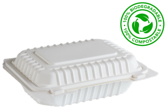
Biodegradable and compostable plastics

For buildings with no green bin or compost collection.