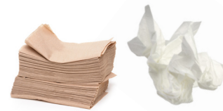
Paper towels, napkins and tissues