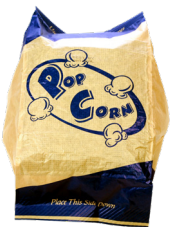
Microwave popcorn bags