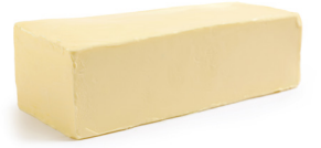
Butter, lard, grease and sauces