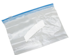
Resealable freezer and snack bags