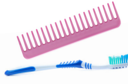
Combs and toothbrushes