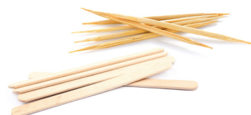
Wooden stir sticks and toothpicks

Search what goes where at york.ca/Bindicator