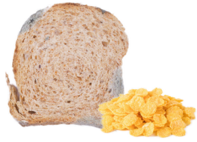
Bread and cereals