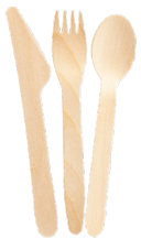
Disposable, compostable cutlery