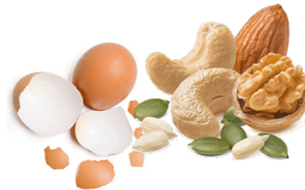
Nuts and shells