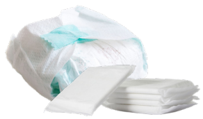
Disposable diapers, sanitary and incontinence products