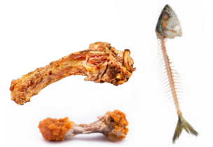
Meat and bones, fish and seafood