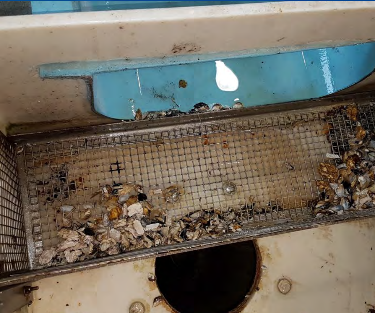
Quagga Mussels – at the intake water screening