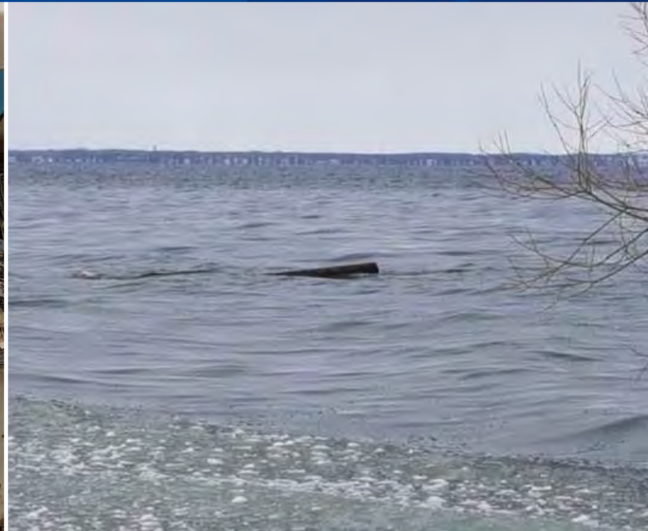
Outfall Pipe – floating at lake surface