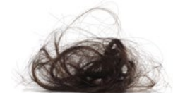
Fur and hair