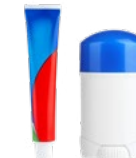
* Deodorant containers, hand cream and toothpaste tubes