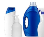
Shampoo, personal care, detergent, household cleaning containers (empty, lids on)