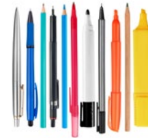
Markers and pens