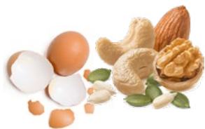
Nuts and shells