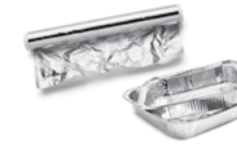
Aluminum foil and trays (empty, crumple foil sheets into balls)