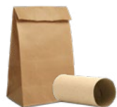
Paper bags and rolls