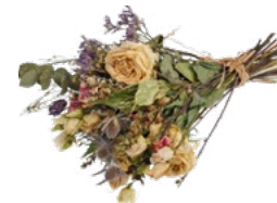
Houseplants and flowers (no pots or soil)