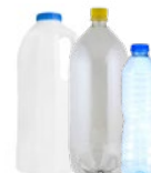
Pop, water bottles and jugs (empty, lids on)