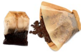
Coffee grounds, filters and tea bags