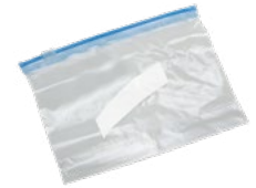
Resealable freezer and snack bags