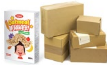
Cardboard and boxboard (flattened)