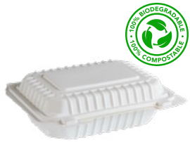
Biodegradable and compostable plastics