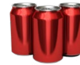
Aluminum cans (empty)