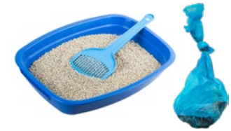
Pet waste (including cat litter)