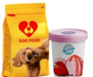
Paper laminate packaging