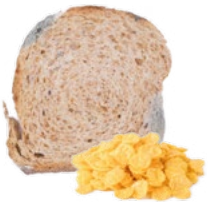
Breads and cereals