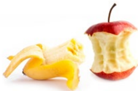
Fruits and vegetables