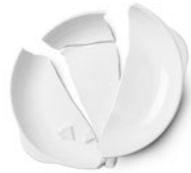
Broken dishes (place broken dishes in box labelled "sharp/glass")