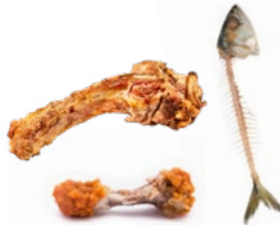
Meat and bones, fish and seafood