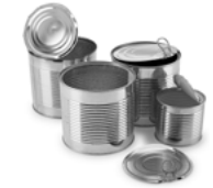
Food cans and tins (empty)