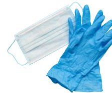
Single-use masks and gloves