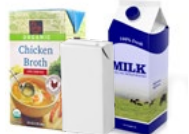
Juice boxes, soup and milk cartons (lids on)