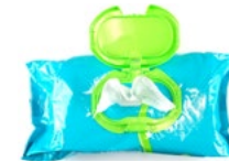
Wipes, mop and dryer sheets