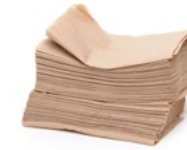
Paper towels and napkins