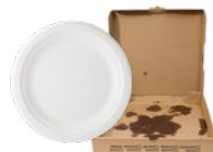
Paper plates, pizza boxes and takeout bags