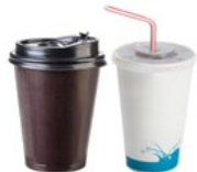
* Hot and cold beverage cups (and straws)