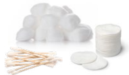
Cotton balls, swabs and pads