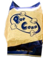
Microwave popcorn bags