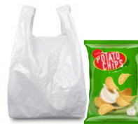
* Flexible plastic bags, food wrappers and packaging