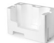
* Foam packaging