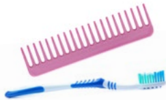
Combs and toothbrushes