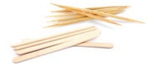
Wooden stir sticks and toothpicks