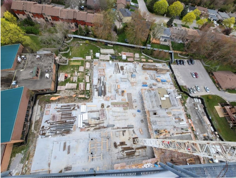
View from Crane