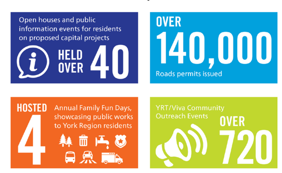
Figure 3 2014 – 2017 Community Outreach Initiatives

In 2017, York Region hosted the first online open house to solicit feedback on capital programs. This format ensured a wider array of residents were able to access information and conveniently provide feedback.