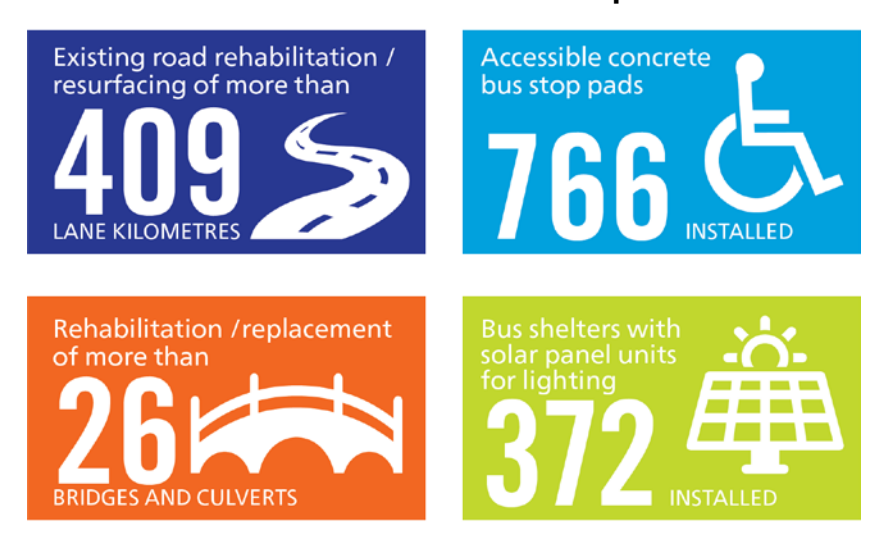
Figure 2 Continuous Maintenance and Operations

Rehabilitation and maintenance includes replacing existing infrastructure with more accessible and efficient options in addition to routine repair and resurfacing of bridges and roads. Figure 2 shows highlights over this Council's term.