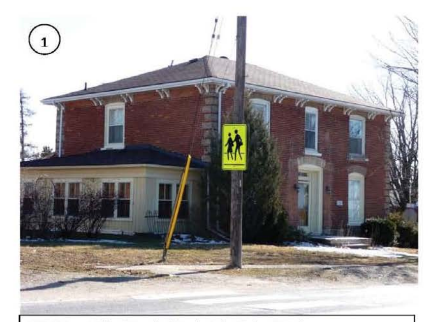
5623 Mount Albert Road - listed - John Stokes Hotel