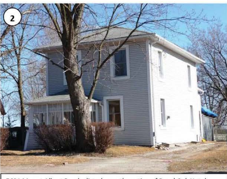
5631 Mount Albert Road – listed – south portion of Royal Oak Hotel