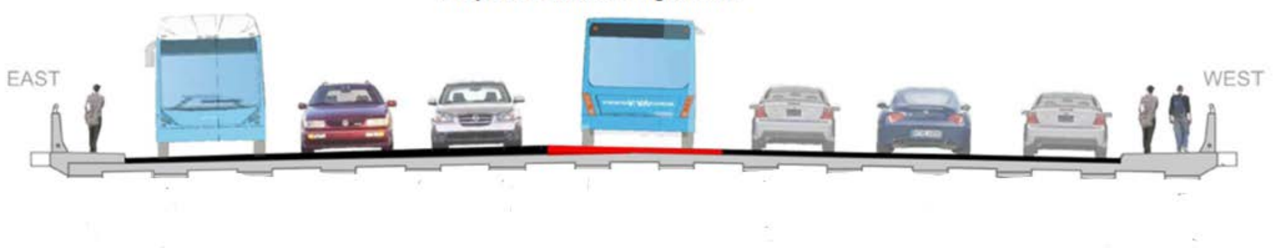
Proposed Lane Configuration

Figure 2: Bathurst Street Bridge at Highway 407 - Cross-section