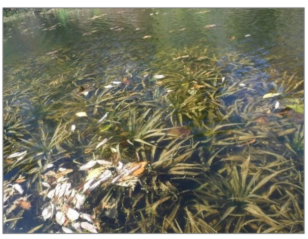
A colony of water soldier

plants was discovered upstream. The collaborative nature of the water soldier response is building - in 2016 the Town of Georgina joined the efforts and supported the installation of a floating barrier at the Sutton Dam to prevent dispersal and