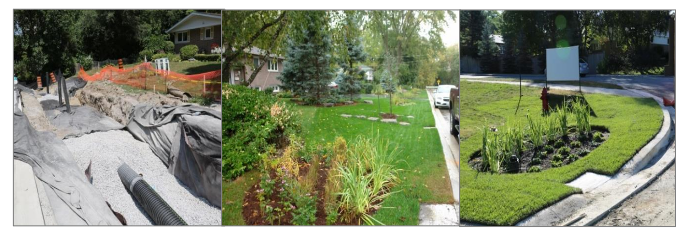
Forest Glen project construction and LID features

By way of example, the Forest Glen Project was intended to mitigate frequent flooding along Western Creek, a tributary of the East Holland River, in an established area of Newmarket. The project featured significant community involvement, and included the installation of a bioswale/filter system, which was comprised of raingardens integrated within the bioswale features in front of each of the residences; and subsurface drainage layers (including a layer of red sand) integrated as two linear conveyance features along each side of the roadway will enhance the filtering of stormwater runoff through the neighbourhood area draining through the LID system thus improve water quality. In summary, this LID retrofit will enhance conveyance capacity, provide stormwater volume reduction, and improve water quality, particularly with respect to phosphorus and total suspended solids.