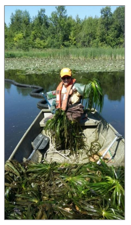
MNRF staff harvesting water soldier

propagation downstream. Given MNRF's prompt actions, water soldier has not become established downstream of the Sutton Dam, and regrowth after treatment has been minimal. Efforts will need to persist if complete eradication is to occur.