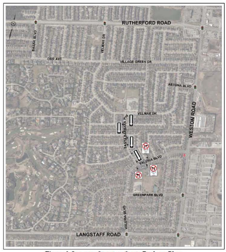
Figure 3 One-way Street on Santa Barbara Place