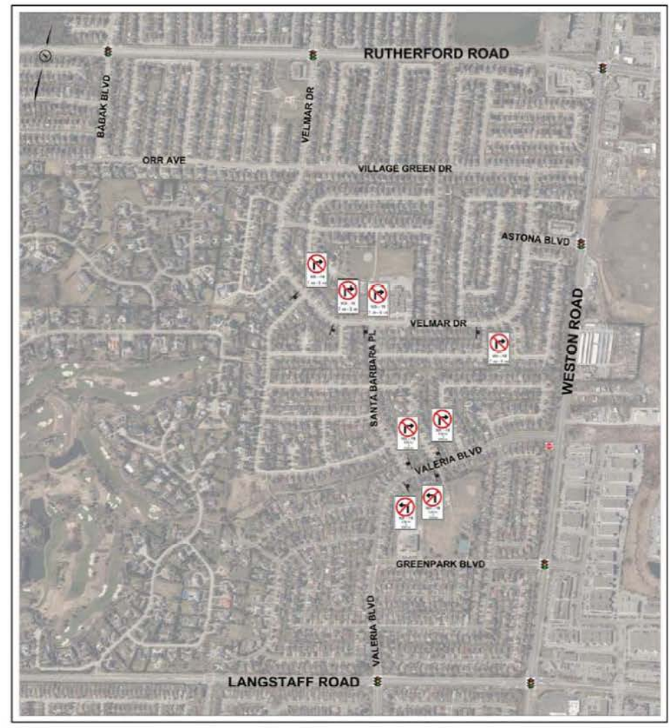
Figure 2 Turn Restrictions on Local Roads