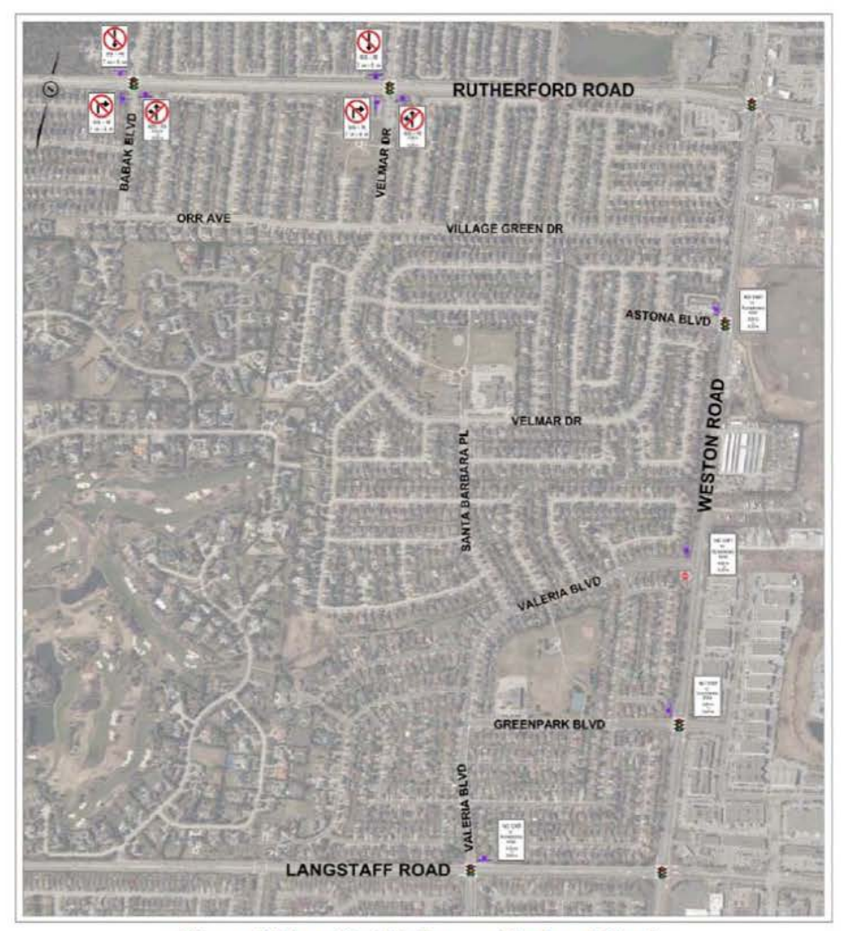
Figure 1 Turn Restrictions on Regional Roads

While this study has not identified a short term solution that is acceptable to the community, the City should continue to work with the Region and the Province to advance improvements to the Regional Roads and Highways in the vicinity of the Weston Downs community. City staff will be preparing a report on findings and community acceptance of the proposed solutions identified in this study. This report will be presented to City Council in the Fall of 2016.