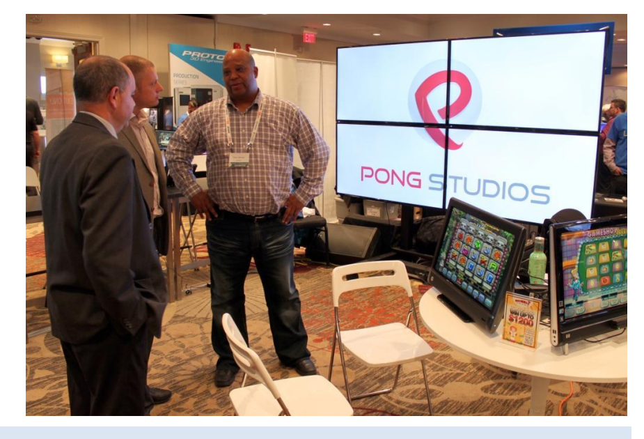
TAVES Consumer Electronics Show reinforces the "end use" focus of the Broadband and Innovation Summit