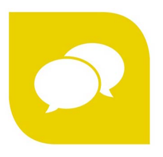
Staying Safe and Connected

Several cross-cutting issues impact the ability of seniors to stay connected to the community, including: