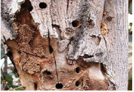
Round exit holes (six-14mm) made by adult beetles emerging from the trees.