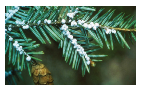
Adelgid nymphs with white woolly covering feeding on underside of hemlock needles