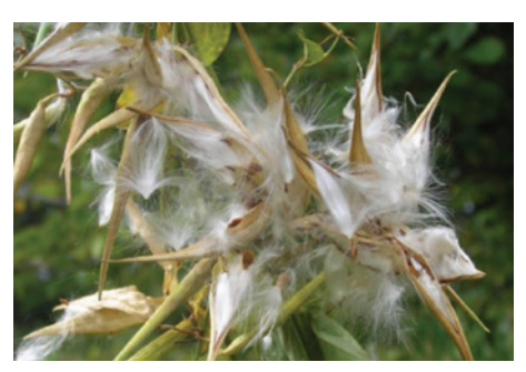
Seed Pods