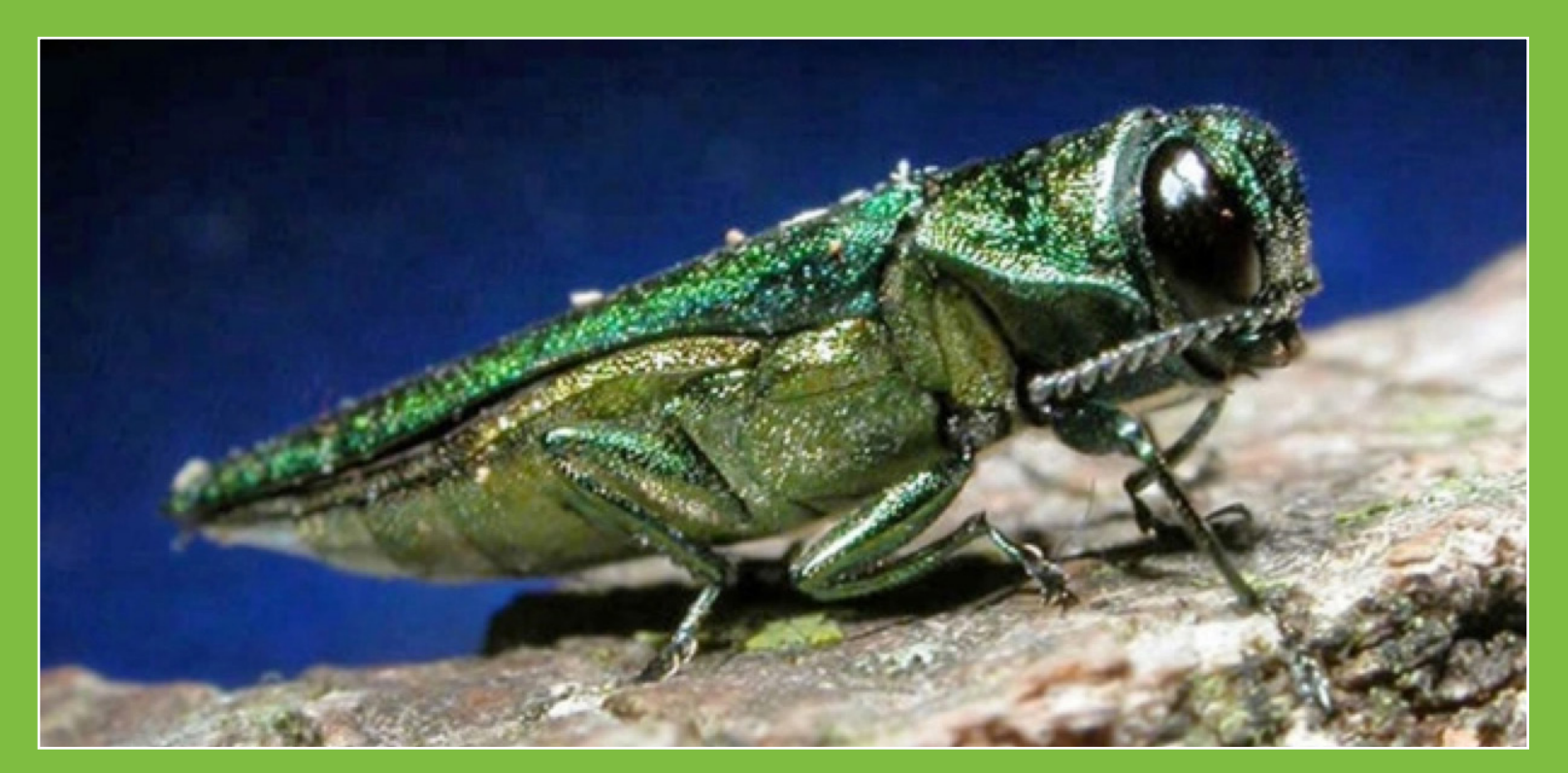
Emerald ash borers, native to China, were accidentally introduced to North America two decades ago, likely through unsecured shipping crates involved with international trading.

BY JUSTIN LI, CBC NEWS POSTED: AUG 17, 2016 3:52 PM ET LAST UPDATED: AUG 17, 2016 5:03 PM ET