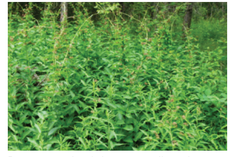
Dense patch of dog-strangling vine

WHERE: Found in isolated locations in Ontario in 2012 and 2013, but these infested trees were removed and the adelgid is not yet known to be established in eastern Canada.