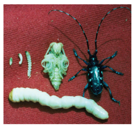
Asian long-horned beetle life stages egg - adult beetle.