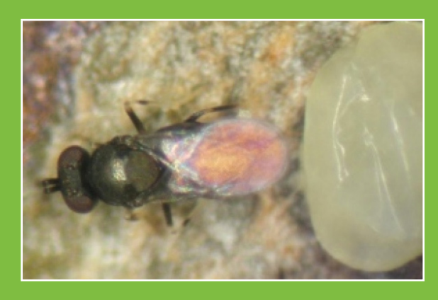
One species of the parasitic wasps released, the Oobius agrili, will lay eggs inside the eggs of the emerald ash borer.

"It's a fairly long-term project," she says. "Could be decades."