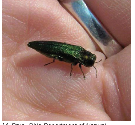
M. Prue, Ohio Department of Natural Resource