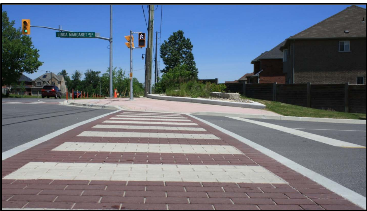
Gamble Road (Bathurst Street – Linda Margaret Avenue)