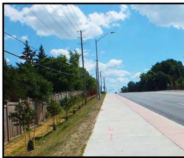
Warden Avenue (16<sup>th</sup> Avenue – Major Mackenzie Drive)