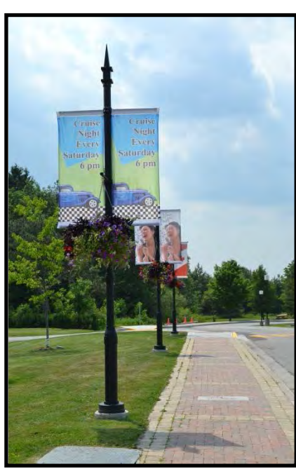
Leslie Street & Mount Albert Road