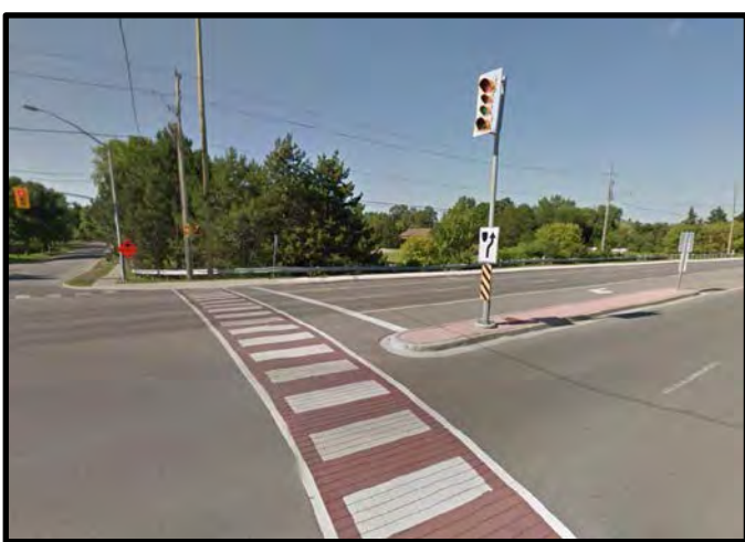
Wellington Street (Bathurst Street – Murray Drive)