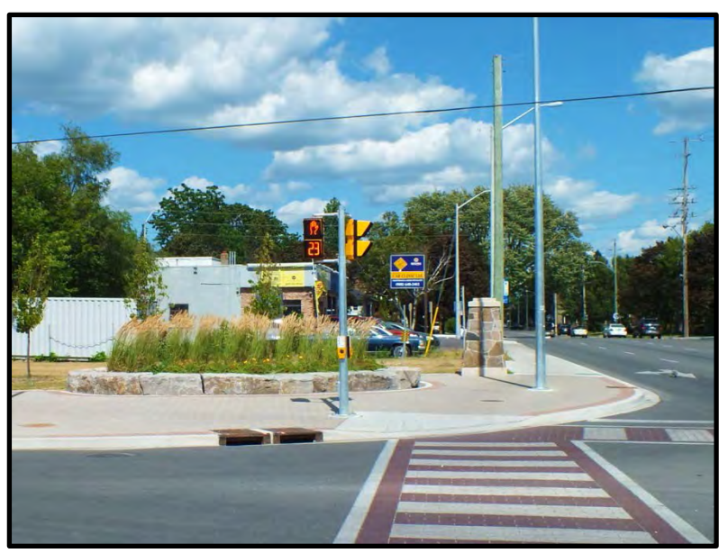
Ninth Line & Main Street