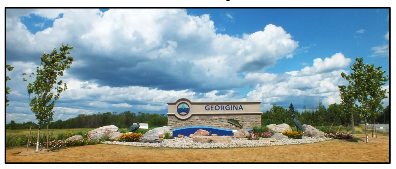
Woodbine Avenue & Ravenshoe Road