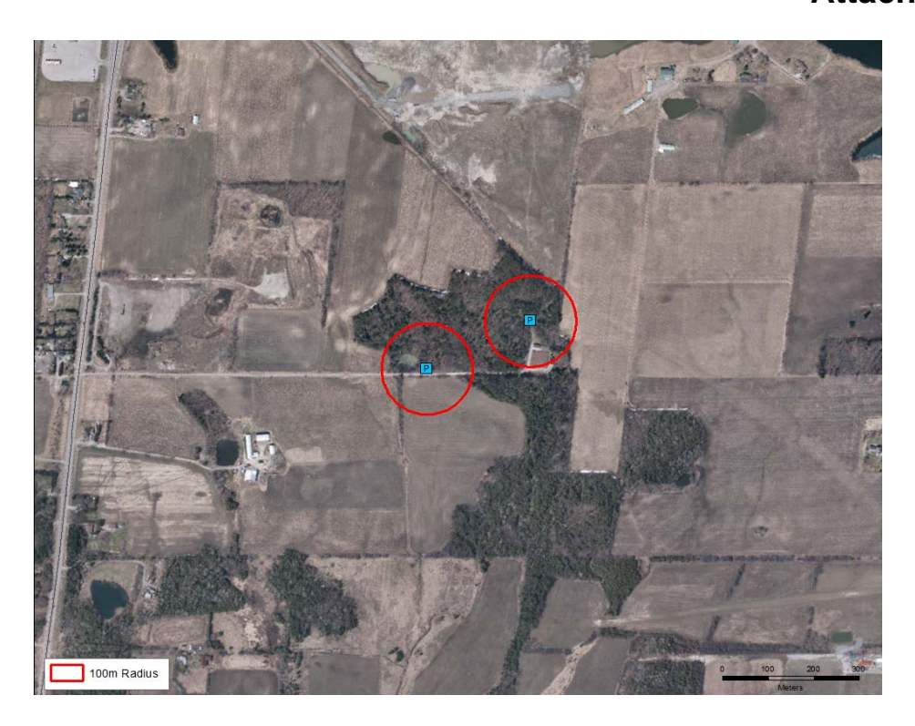
Farms within 100m of York Region Production Wells