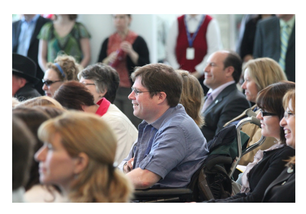
National Access Awareness Week 2011