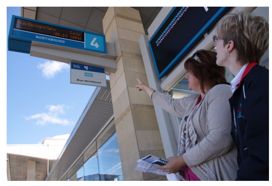
YRT/Viva MyRide Travel Training Program