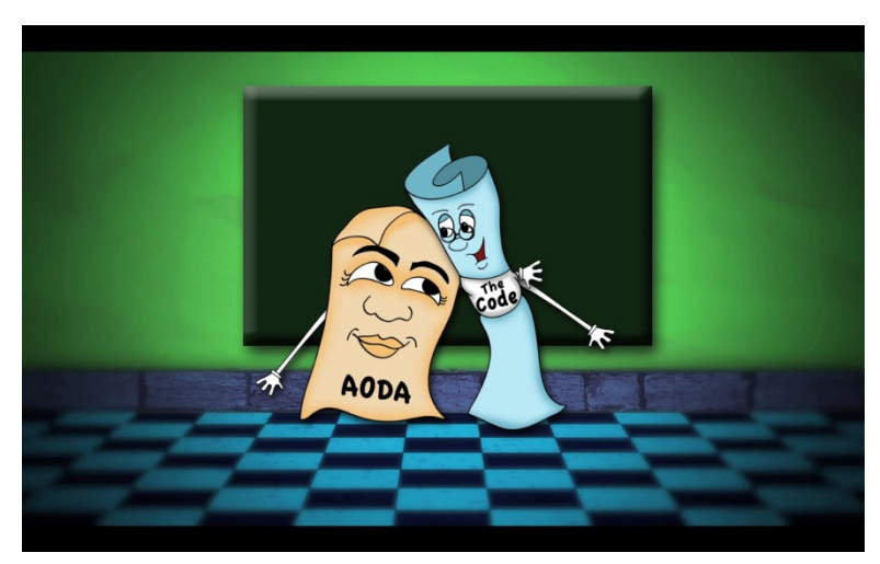
Creating an Accessible York Region Training Module