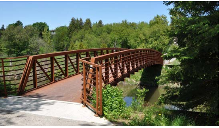
Nokiidaa Trail Connection in East Gwillimbury