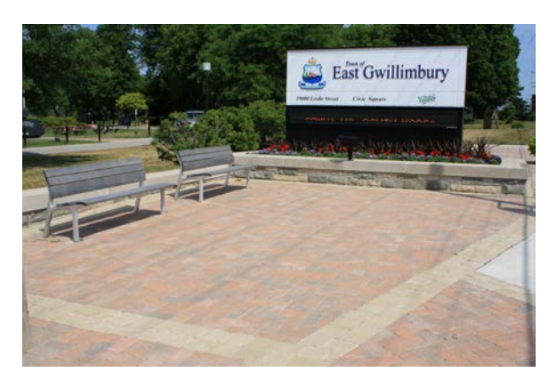
Leslie Street and Mount Albert Road