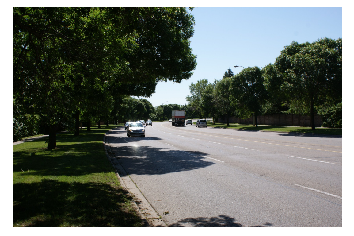
Figure 1: Don Mills Road with ash street trees prior to removal, June 12th, 2013

Figure 2: Don Mills Road following ash street tree removal, November 19th, 2013