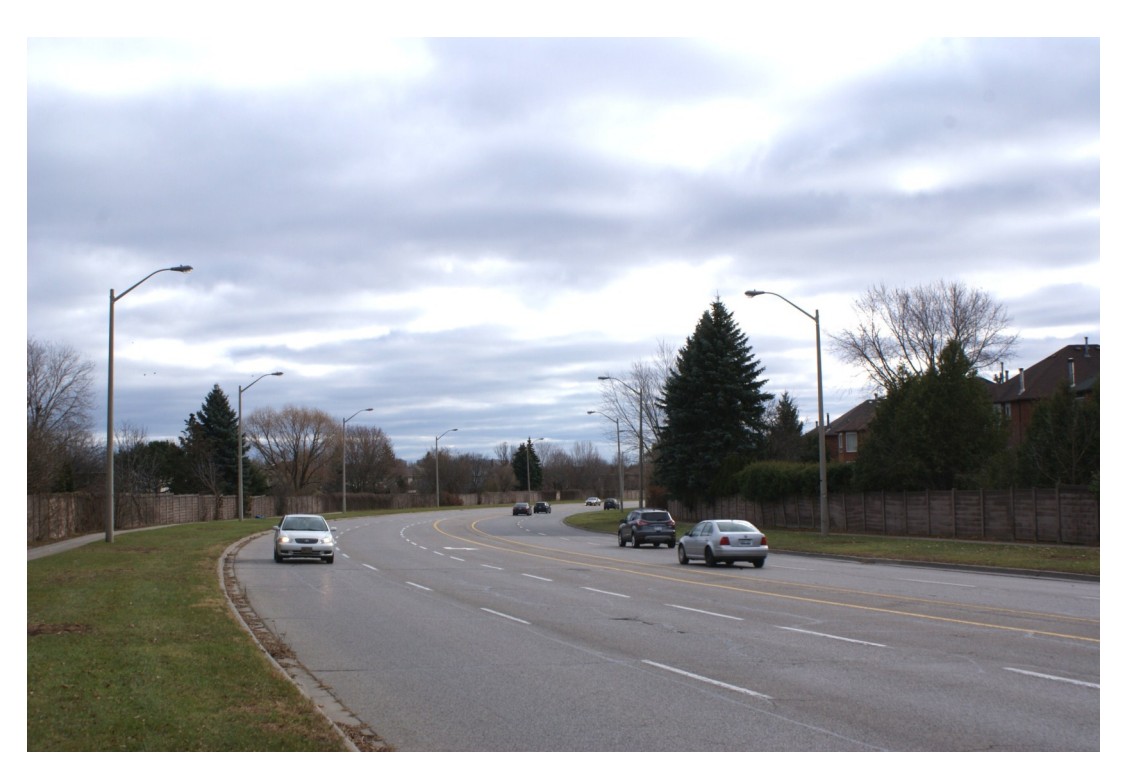
Figure 2: Don Mills Road following ash street tree removal, November 19th, 2013

Figure 1: Don Mills Road with ash street trees prior to removal, June 12th, 2013