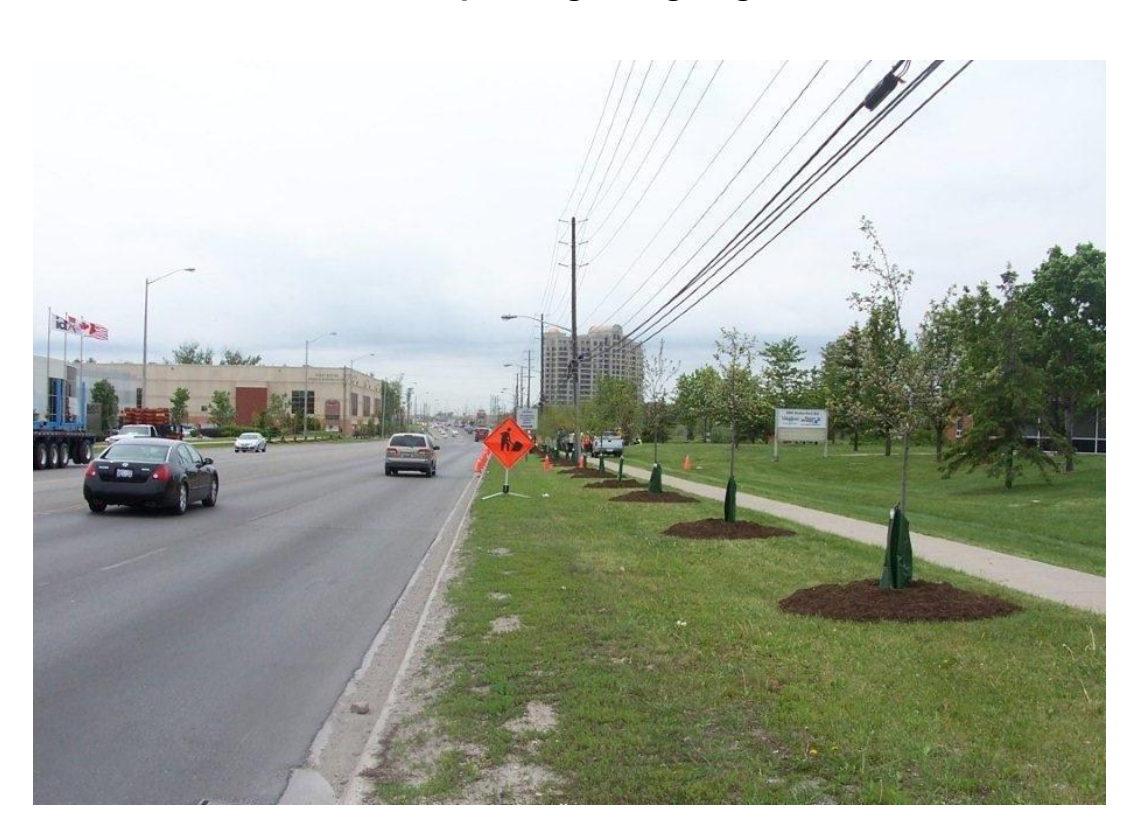
Street Tree Replanting Along Regional Roads