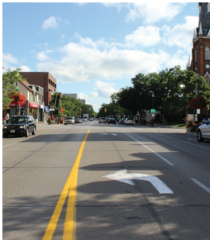
Left-turn lanes can reduce delays at intersections