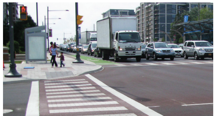
Zebra markings at crosswalk enhance visibility