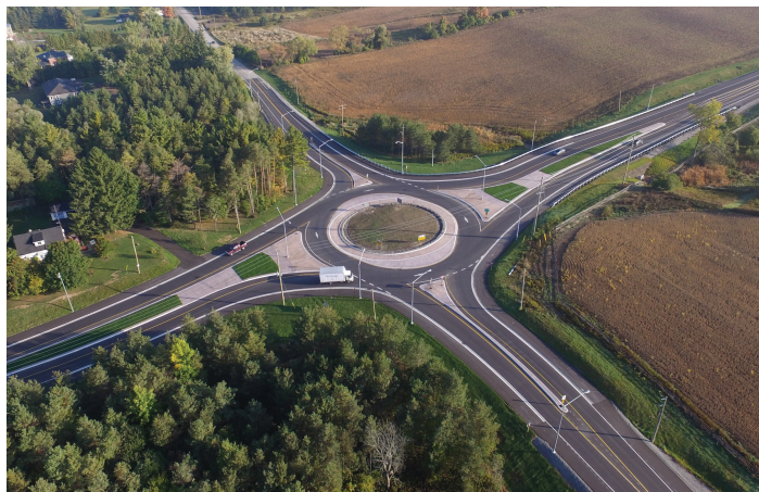
Keele Street and Lloydtown-Aurora Road Roundabout, York Region Roundabouts may reduce delays and queues on Regional roads