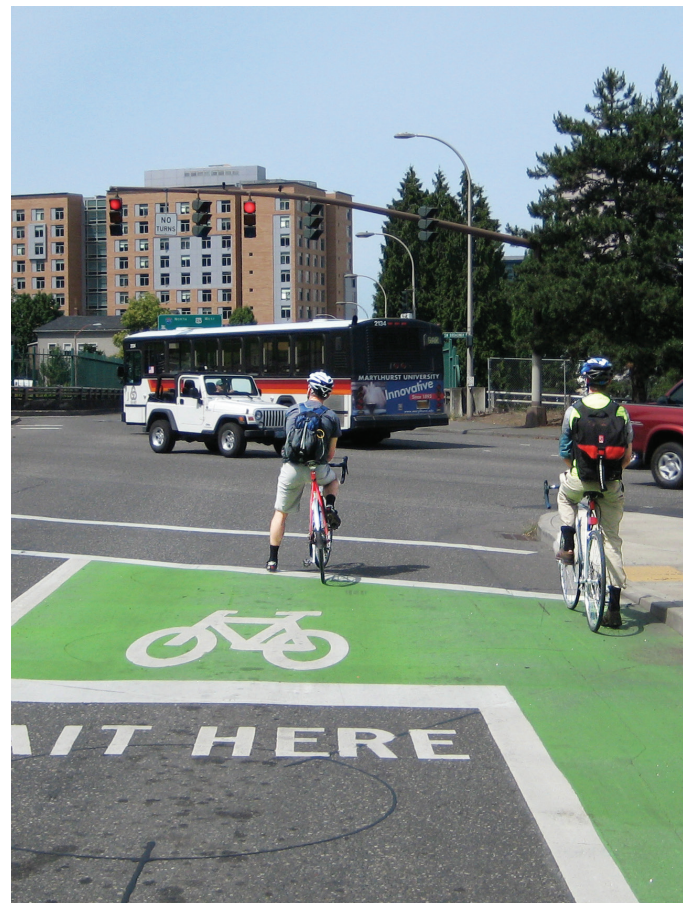
A bike box at an intersection improves cyclists' visibility and allows them to proceed first