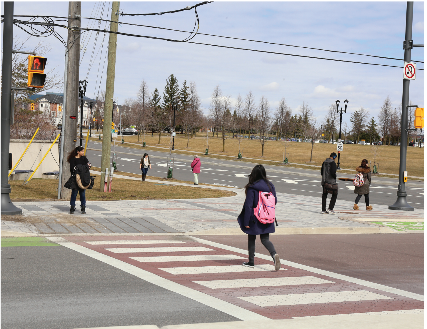
Create safe, shared spaces for multiple modes of movement at intersections