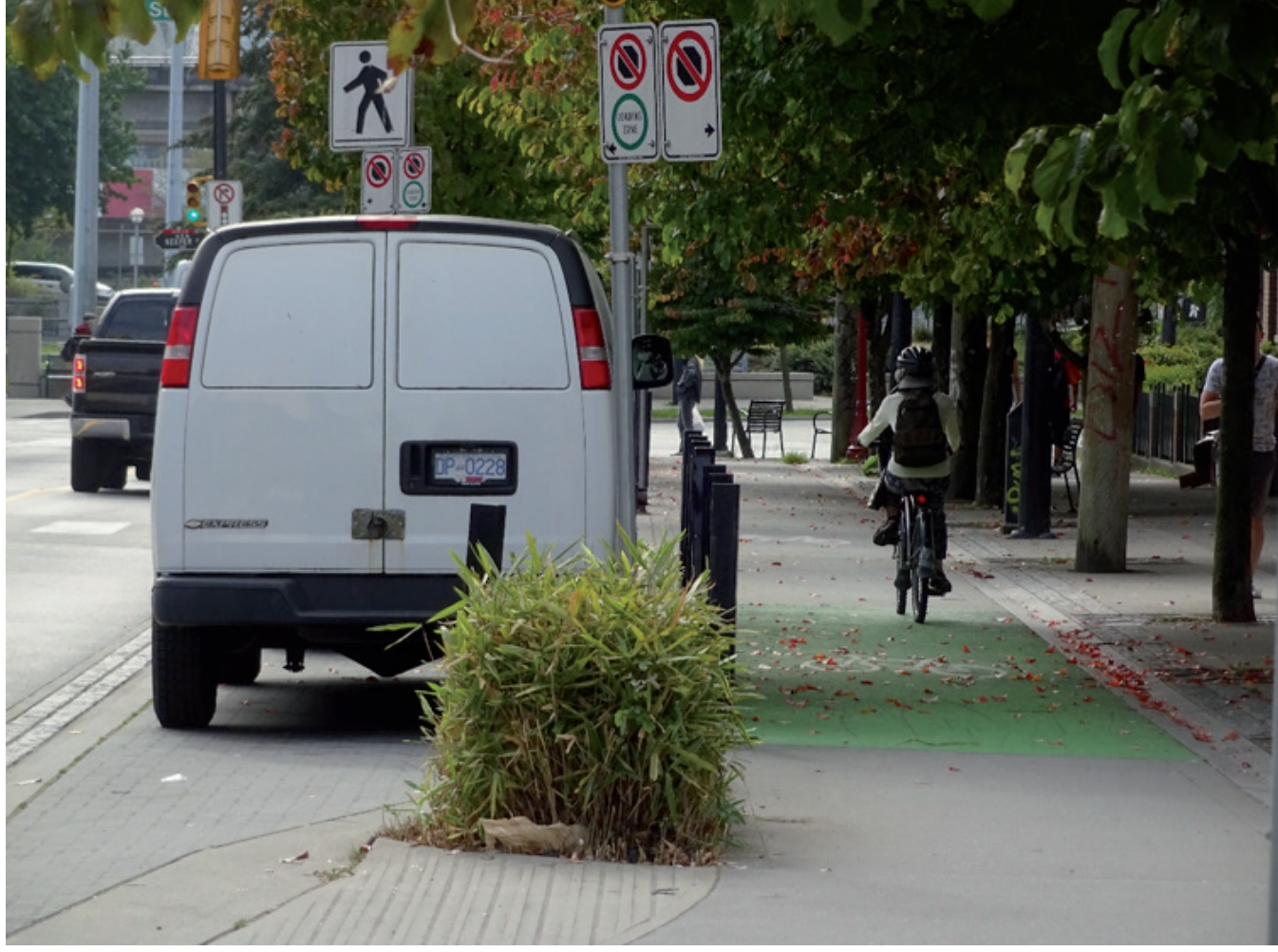
Exhibit 9-3. Tree planting between a raised cycle track and pedestrian clearway