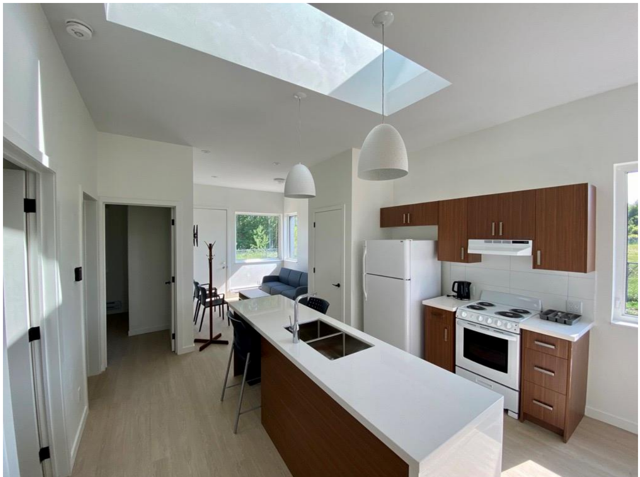
Suite Kitchen and Living Space