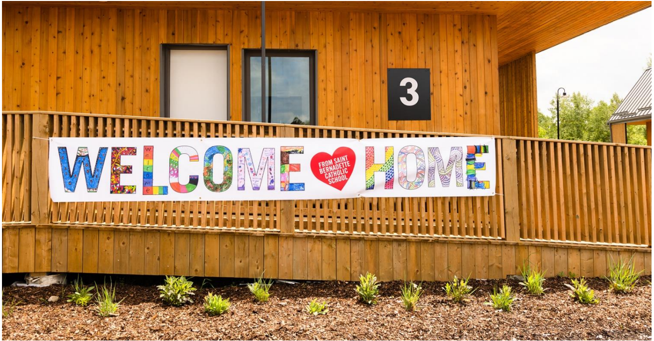
Welcome Banner Prepared by Students at Saint Bernadette Catholic School