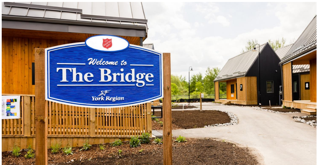
New Units at The Bridge