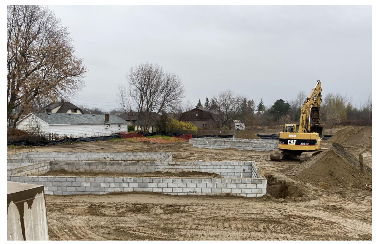
Buildings 2 & 3 – Foundation walls