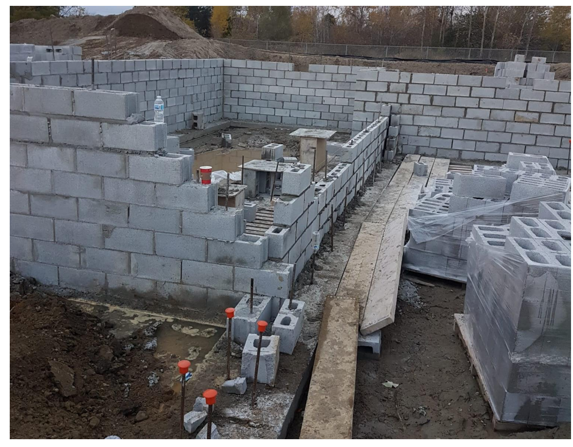
Building foundation and footings installation