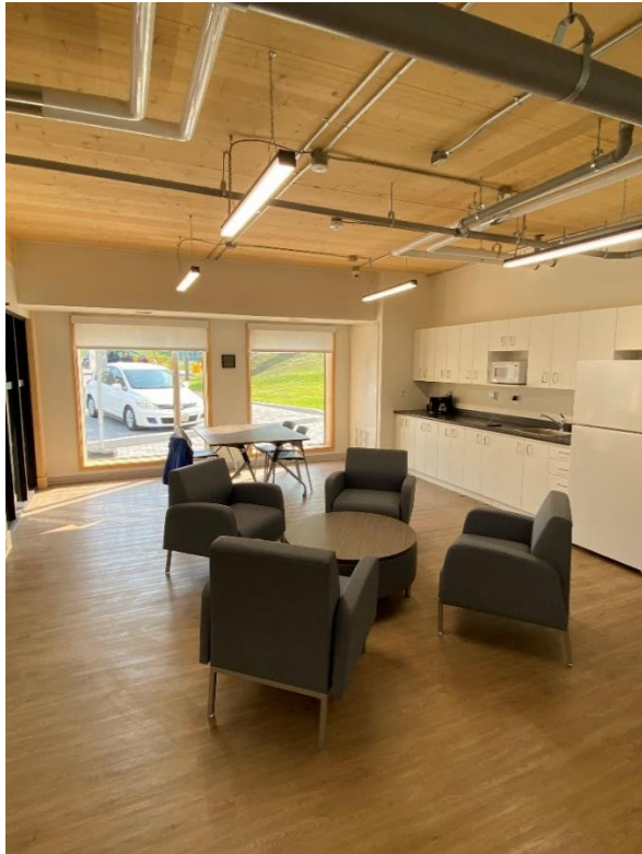
Common Indoor Amenity Space