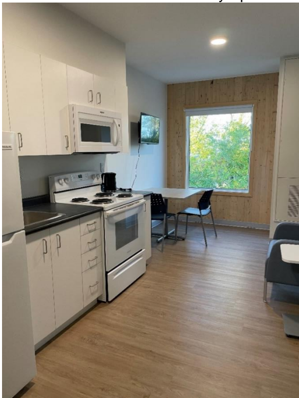
Suite Kitchen and Living Space