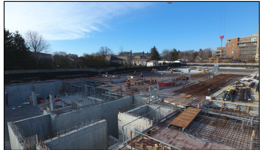
Completing the Underground Parking and Erecting the Superstructure