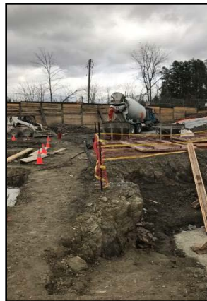
Excavation and Shoring