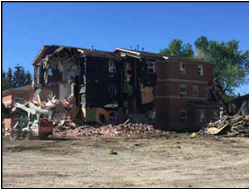
Demolition of Previous HYL Buildings