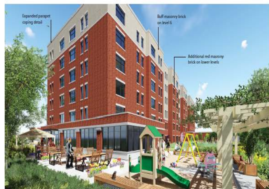
CURRENT DESIGN - SOUTH WEST CORNER VIEW - OUTDOOR AMENITY AREA