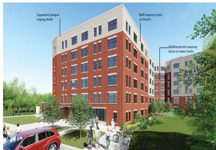
CURRENT DESIGN - EAST VIEW - RESIDENTIAL ENTRY AND DROP-OFF ABELL AVE