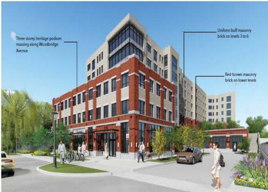
PREVIOUS DESIGN - VIEW FROM WOODBRIDGE AVENUE