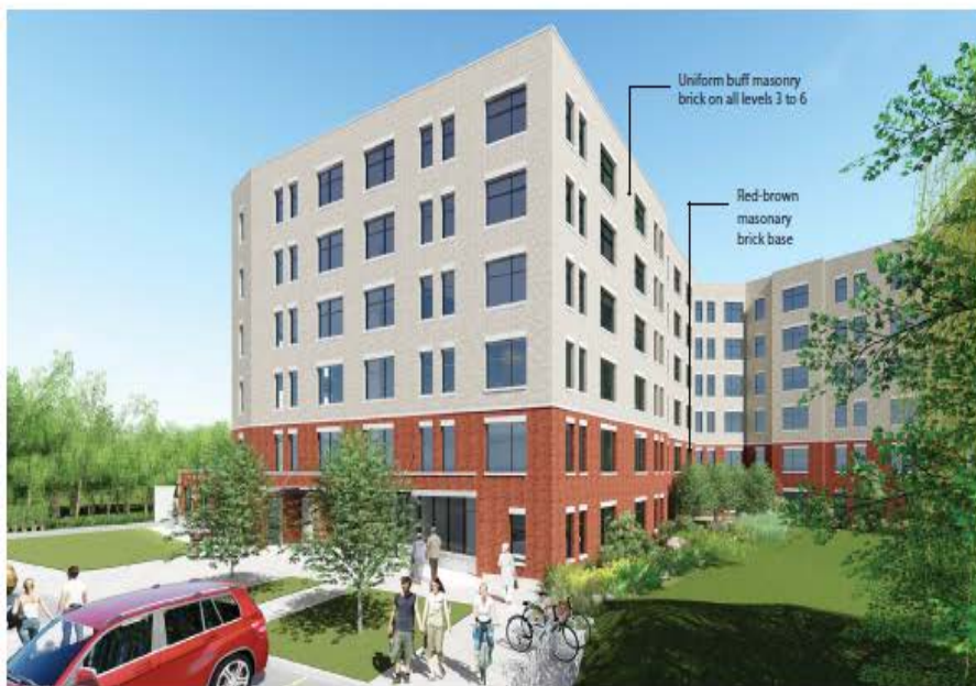
PREVIOUS DESIGN - EAST VIEW - RESIDENTIAL ENTRY AND DROP-OFF ABELL AVE