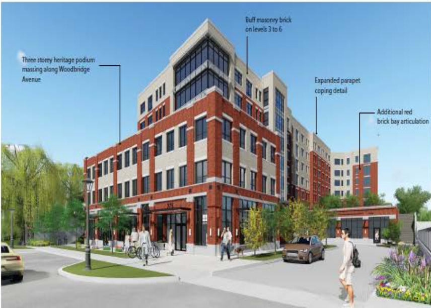
CURRENT DESIGN - VIEW FROM WOODBRIDGE AVENUE