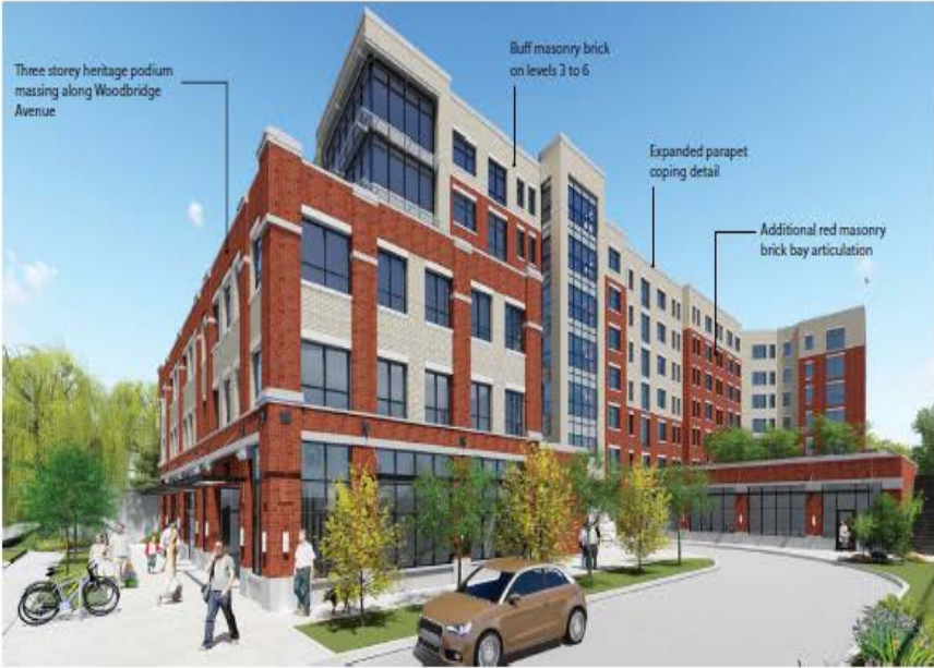
CURRENT DESIGN - VIEW FROM ACCESS DRIVEWAY