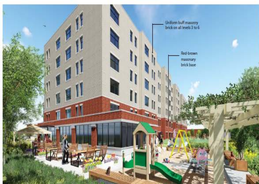
PREVIOUS DESIGN - SOUTH WEST CORNER VIEW - OUTDOOR AMENITY AREA