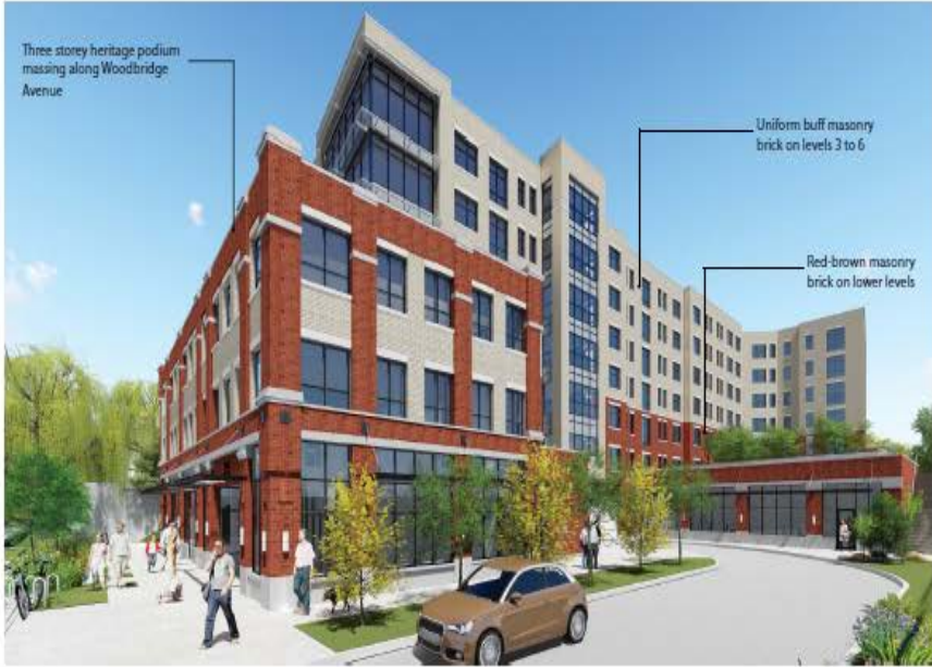
PREVIOUS DESIGN - VIEW FROM ACCESS DRIVEWAY