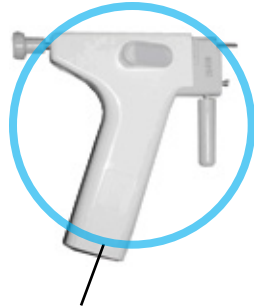
Hand clasp device