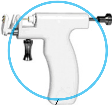
Ear piercing gun

These items are cleaned and disinfected or sterilized between clients: